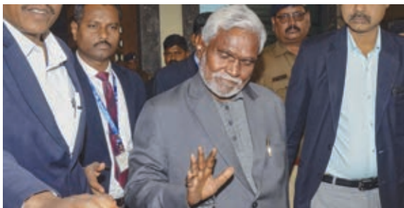
Jharkhand CM Champai Soren after his government won the floor test in the state Assembly in Ranchi on Monday.

The Jharkhand government led by Champai Soren won the floor test in the state Assembly Monday.