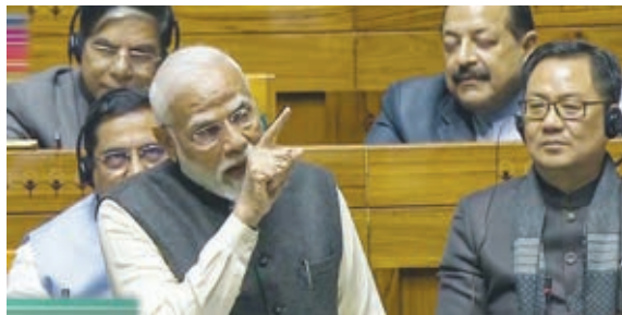
Prime Minister Narendra Modi replies to the Motion of Thanks on the President’s address in Lok Sabha during the Budget session in New Delhi on Monday.

Expressing confidence that the NDA will get more than 400 seats and the BJP will win at least 370 seats in the Lok Sabha elections, Prime Minister Narendra Modi said Monday that he was convinced that the Opposition parties have lost the courage to contest the elections and have resolved to stay on the Opposition benches for a long time.