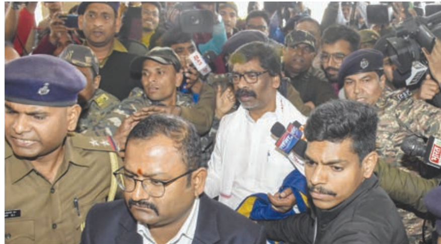
Former Jharkhand chief minister and JMM leader Hemant Soren arrives to take part in the trust vote of the Champai Soren-led government in Ranchi on Monday.