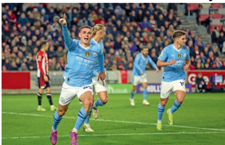
Manchester City's Phil Foden (left) celebrates after scoring against Brentford during the English Premier League match at the Gtech Community Stadium in London on Monday. Manchester City won 3-1.

Haaland had a huge chance to mark his first start for two months with a goal moments later, but could not beat Flekken when sent clean through on goal.