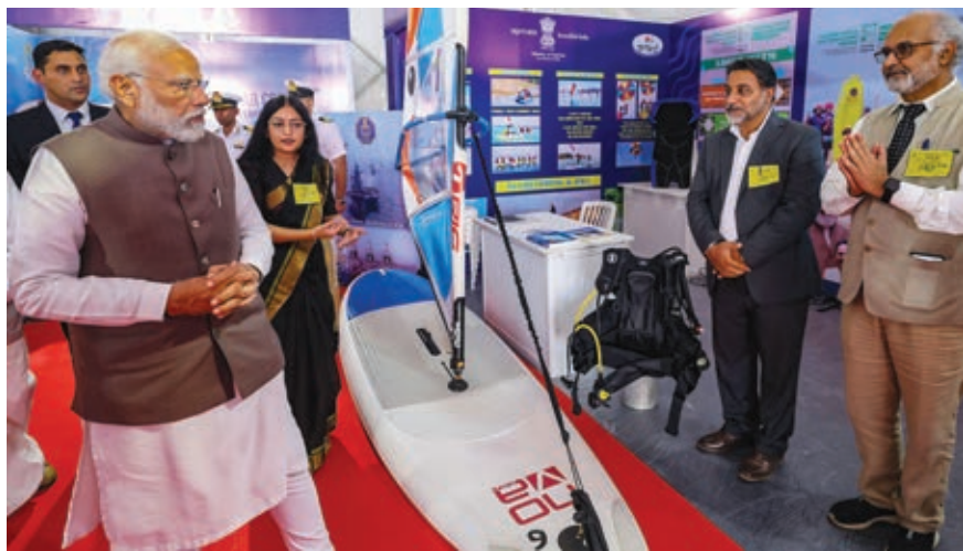
Prime Minister Narendra Modi visits an exhibition during the "Viksit Bharat, Viksit Goa 2047" programme for the inauguration and foundation stone-laying of various projects in Goa on Tuesday.

During the meeting, the Prime Minister inaugurated the campuses of the National Institute of Technology at Cuncolim, National Institute of Water Sports at Dona Paula and the Waste Management Facility at Curchorem.