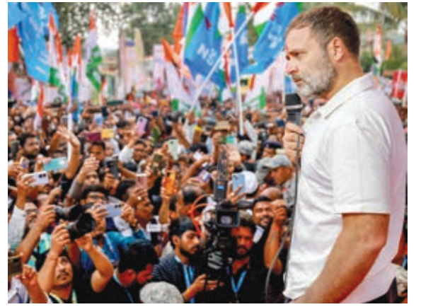
Congress leader Rahul Gandhi addresses supporters during national flag handover ceremony as the "Bharat Jodo Nyay Yatra" enters Odisha on Tuesday.

The minister added that under the present government, an inter-ministerial Central team is being dispatched even before a request from the state government comes.