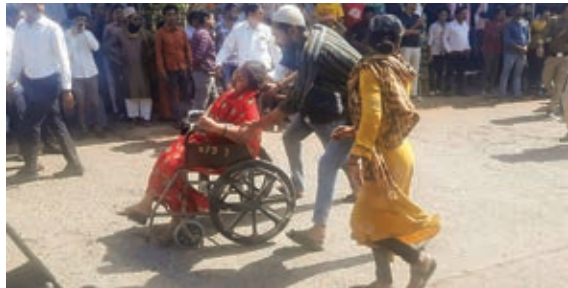
An injured person being shifted to a hospital after a massive fire broke out in a firecracker factory in Madhya Pradesh's Harda town on Tuesday.

At least eleven people, including four women, were on Tuesday killed and over 170 others injured in a powerful explosion and subsequent fire that broke out in a firecracker factory in district headquarters of Harda in Madhya Pradesh. The incident took place in Bairgarh on the outskirts of Harda town at around 11 am. The death toll may rise since several people were still feared trapped under the debris of the collapsed building, sources said. Around 60 houses near the factory were completely gutted in the fire, officials said. The National Disaster Response Force and State