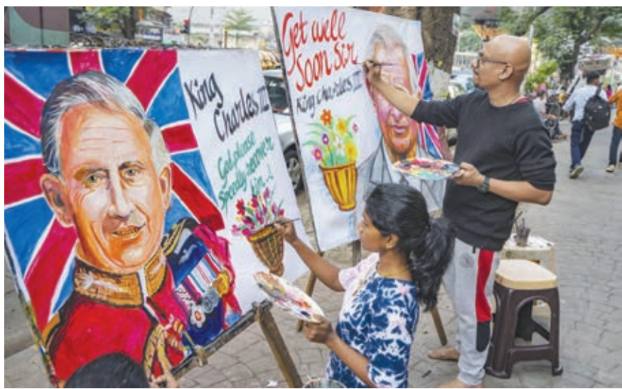
Artists give finishing touches to paintings of King Charles III with a message of "get well soon" outside an art school in Mumbai on Tuesday. King Charles III has been diagnosed with cancer.