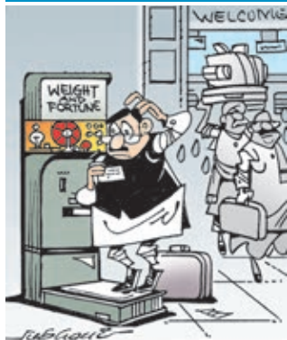
Bad luck! You will not get a party ticket this time!