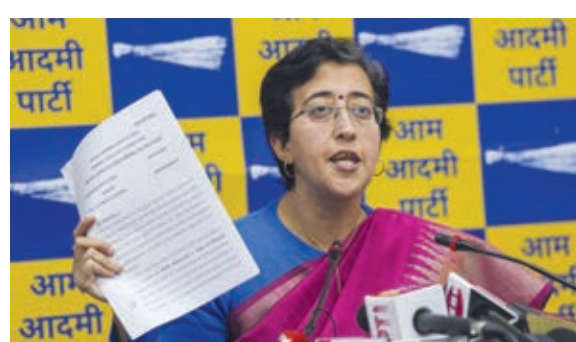
Delhi minister Atishi addresses a press conference on ED raids in New Delhi on Tuesday.

Soon after the raid, Delhi minister and senior AAP leader Atishi accused the BJP-led Centre of trying to "scare and silence" the AAP by conducting raids on its leaders.