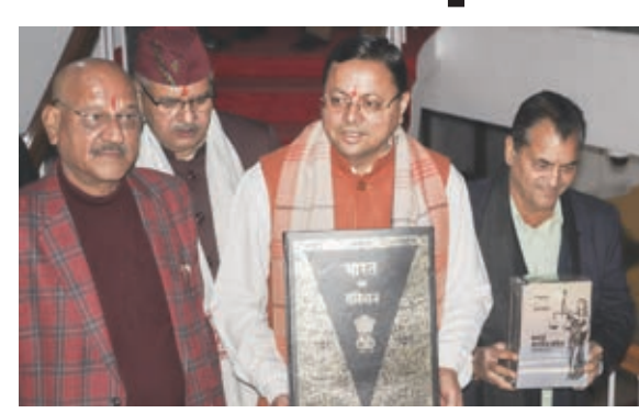
Uttarakhand chief minister Pushkar Singh Dhami with others holds a copy of the Constitution of India at Vidhan Sabha Bhavan in Dehradun on Tuesday.

The Opposition also protested against the decision of the business advisory committee to sus-