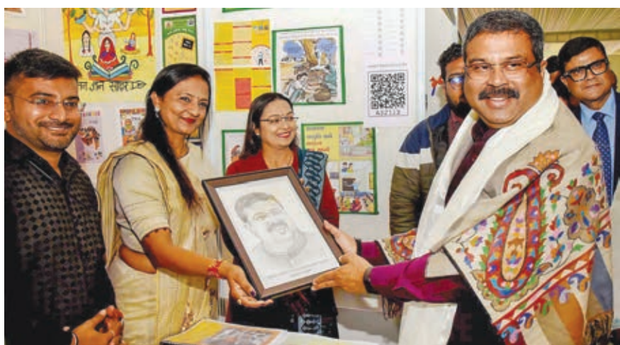
Union minister Dharmendra Pradhan and minister of state Annpurna Devi visit an exhibition of the "ULLAS MeLa" in New Delhi on Tuesday.

Official sources cited the direction of Rajya Sabha on August 11, 2023 that Mr Singh's suspension for unruly conduct during the monsoon session will remain in force and he cannot attend proceedings till the privileges committee submits its report and it is considered by the House.