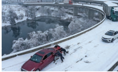
Vehicles are stuck on a highway due to heavy snow in Wuhan, in China's Hubei province on Tuesday. — AFP

The disruptions coincide with the biggest mass travel migration in the world as people flock home to see their families for the Chinese New Year holiday, which officially begins on Saturday. Over the past few days, Chinese social media videos showed images of people stranded on trains and trapped in cars on snowy highways. — Reuters