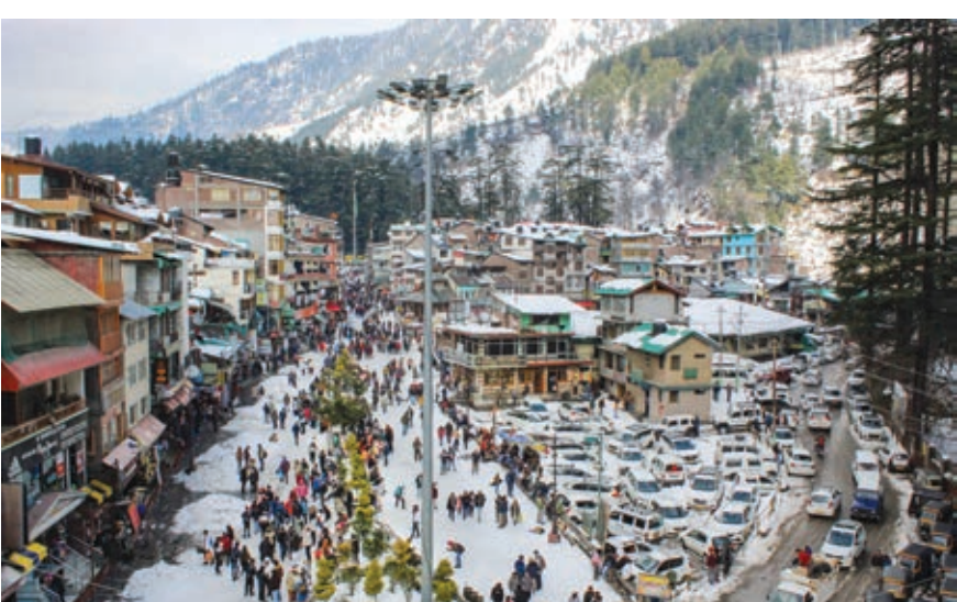
Tourists at the snow-covered Mall Road after a fresh snowfall in Manali on Tuesday. Over 470 roads, including four national highways, remained closed in Himachal Pradesh after snowfall and rain in several parts.