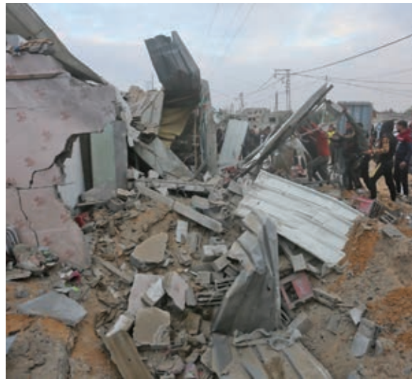
Palestinians look at a house destroyed in an Israeli strike in Rafah, Gaza Strip.

Separately, the United Kingdom Maritime Trade Operations (UKMTO) agency and British maritime security firm Ambrey reported an explosion near a