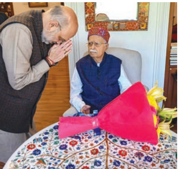
Union home minister Amit Shah with senior BJP leader Lal Krishna Advani during a meeting on Tuesday.