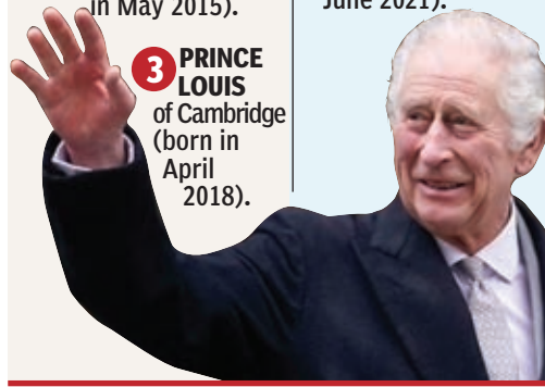
King Charles has put off his engagements to undergo treatment.

2 LILIBET MOUNTBATTEN Windsor (born to Harry and Meghan in June 2021).