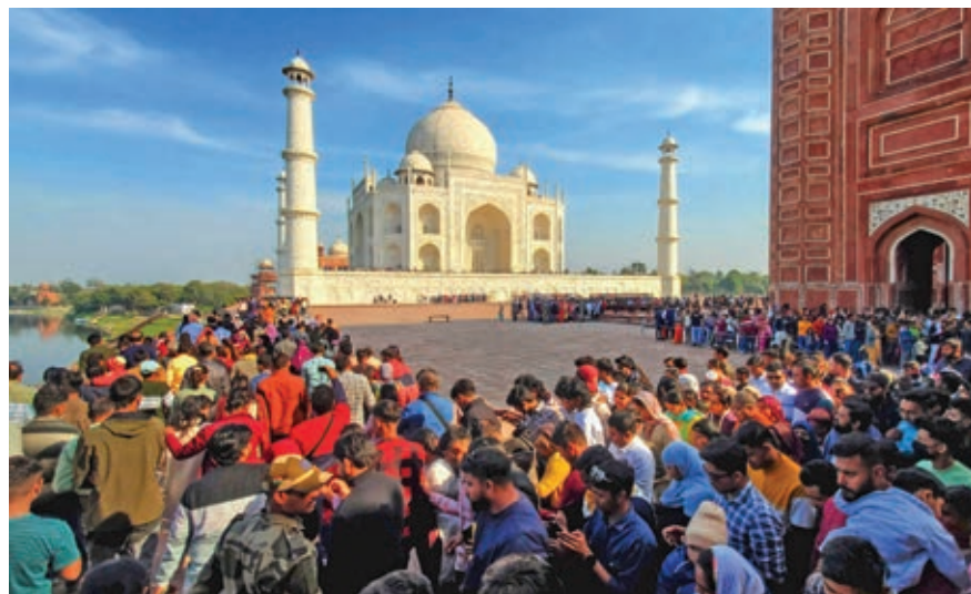
A rush of tourists at the Taj Mahal during the 369th Urs of Mughal Emperor Shah Jahan in Agra on Wednesday.