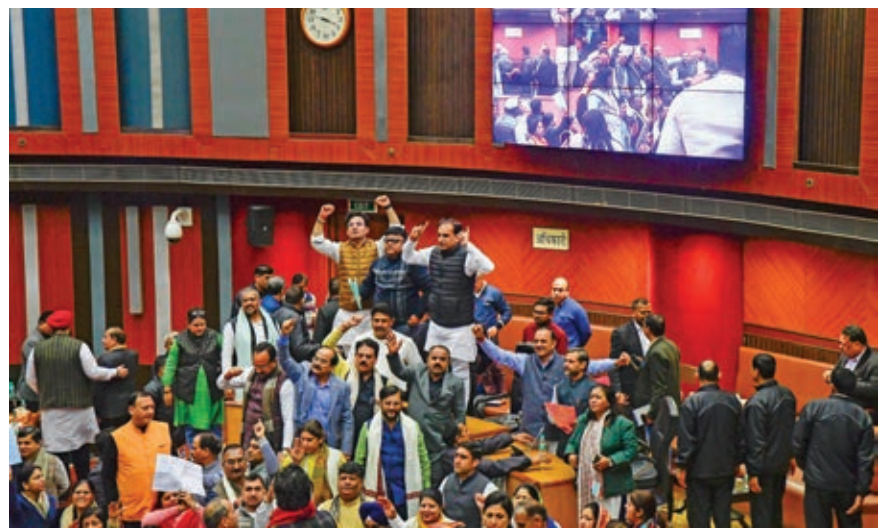
Delhi mayor Shelly Oberoi speaks as Opposition councillors protest inside the Municipal Corporation of Delhi at the Shyama Prasad Mukherjee Civic Centre in New Delhi on Wednesday.

The city BJP chief Virendra Sachdeva meanwhile said, everyday Ms Atishi spends time on defending the corruption of her government, if only she spends the same time on her administrative duties then water supply and sewage treatment in Delhi would improve.