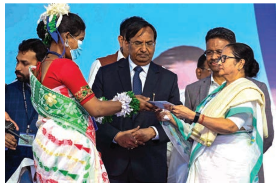
West Bengal chief minister Mamata Banerjee felicitates a scheme beneficiary during a meeting in Howrah on Wednesday.