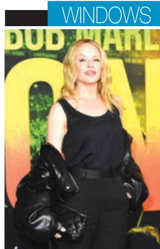
Singer Kylie Minogue at the premiere of Bob Marley: One Love in Los Angeles on Tuesday.

www.asianage.com RNI No. 57290/94, Regd No: DL-SW-05/4189/15-17 Vol. 30 No. 353 | 16 PAGES | ₹5.00