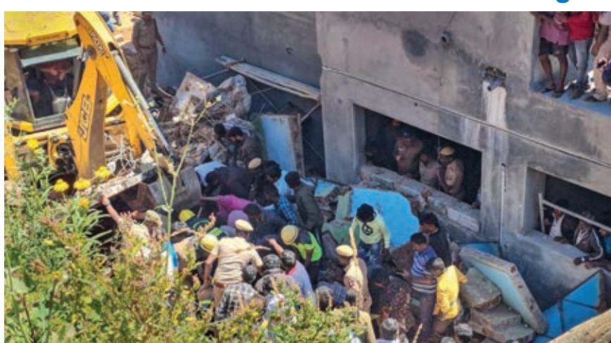
Rescue operation underway after a building collapsed at a construction site at Udhagamandalam in Nilgiris district on Wednesday. Six women construction workers died after they got buried under sand and rubble.