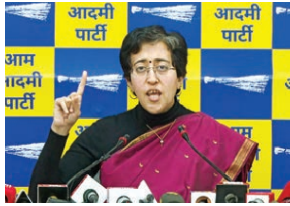
Delhi minister Atishi addresses a press conference in New Delhi on Wednesday.

The statement further stated, "It's clear that the Modi government is a big believer in Hitler's ideology, 'if you repeat a lie a