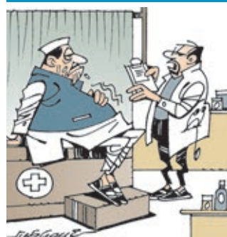
2 km morning walk is not enough... take at least 20 km padayatra every day!