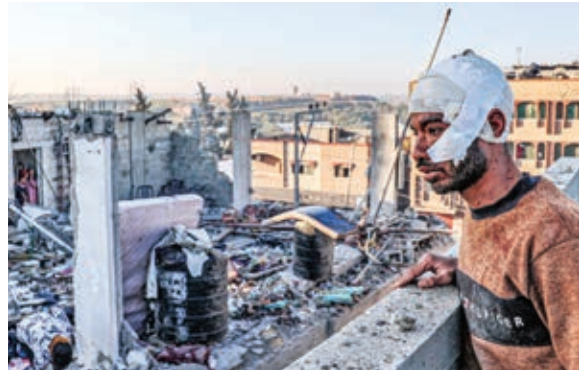
An injured man with a bandaged head looks on while standing next to the rubble and debris of a destroyed building in the aftermath of Israeli bombardment on Rafah in the southern Gaza Strip on Wednesday.

The second phase would include the release of remaining male hostages and "the withdrawal of Israeli forces outside the borders of all areas of the Gaza Strip".