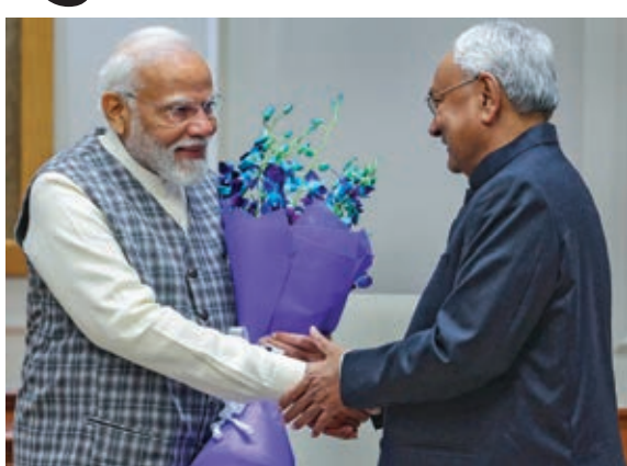
Prime Minister Narendra Modi with Bihar chief minister Nitish Kumar at a meeting in New Delhi on Wednesday.

The Prime Minister said India has moved out of the "Fragile Five" during the Congress-led UPA government to be among the top five economies of the world. "Sabka saath is not a slogan, it is Modi's guarantee," the Prime Minister said in