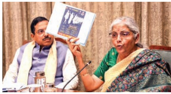
Finance minister Nirmala Sitharaman with Union minister of parliamentary affairs Pralhad Joshi during a press conference in New Delhi on Wednesday.

₹1.8 lakh crore Budget of the Union territory of Jammu and Kashmir with a voice vote as well. The two Budgets, along with the supplementary demands for grants and relevant appropriation bills, were piloted by Ms Sitharaman. "The fiscal deficit of the Central government is proposed to be brought down to 5.1 per cent of the GDP during 2024-25," the minister said while replying in LS. Concerned about the Centre not giving funds to states, Ms Sitharaman assured the House and said, "Whatever the Finance Commission has recommended, I do follow it to the last word. As far as Karnataka is concerned, the state is receiving funds as per finance commission recommendation and on time as well. In