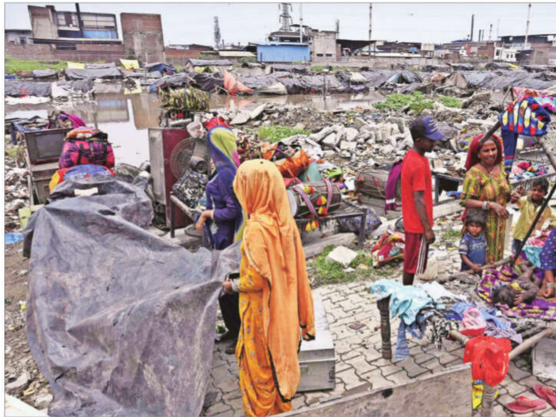
The CEO of NITI Aayog has announced that the poor in India are no more than 5% of the population