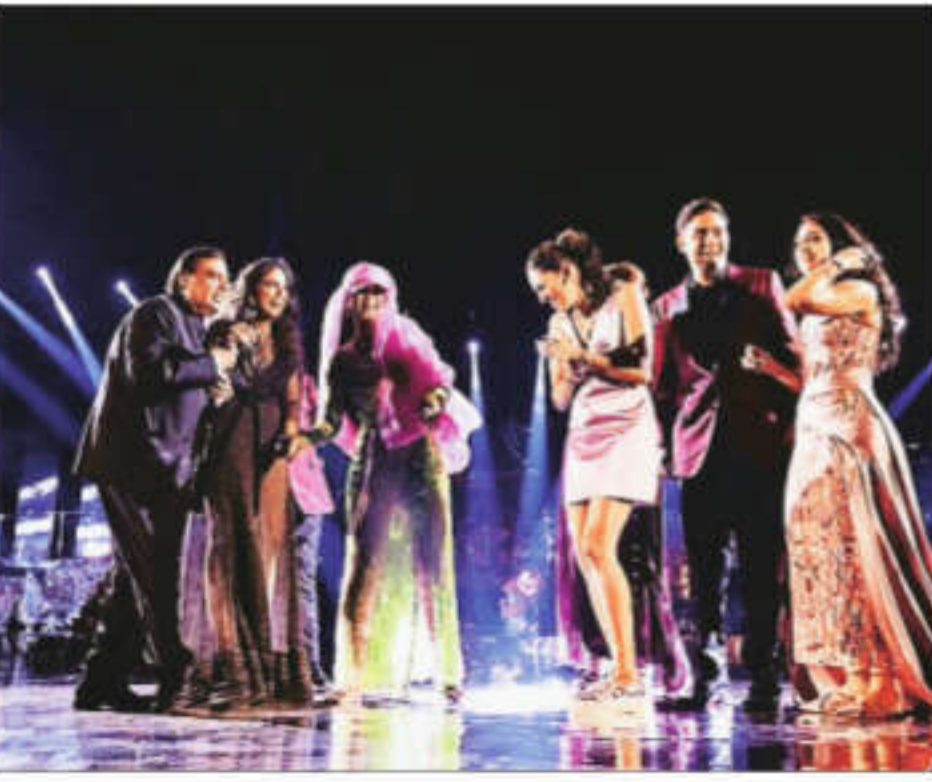
Rihanna with the Ambani family in Jamnagar, Gujarat

The 38-year-old singer-songwriter thanked the Ambanis for making her a part of the family affair. "Thanks to the Ambani family I'm here tonight in honour of Anant and Radhika. Thank you for having me here. God bless your union. I wish you the best. Congratulations," she said. As the prelude of her song We Found Love played, Rihanna asked the audience members if they believed in love. "Make some noise for love right now. Send some