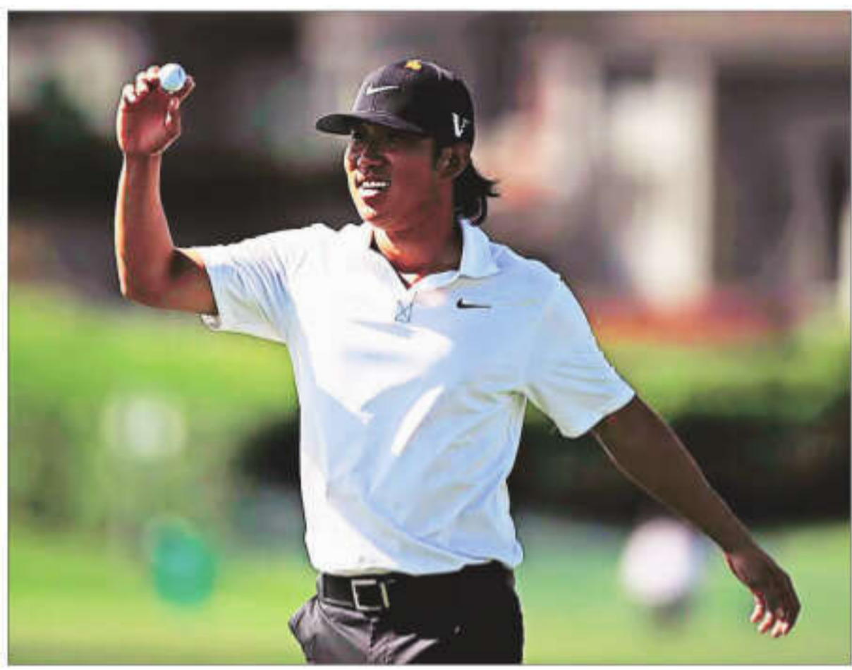
Anthony Kim is playing the LIV Golf Tour's third event of the year this weekend at the Royal Greens Golf Club in Jeddah