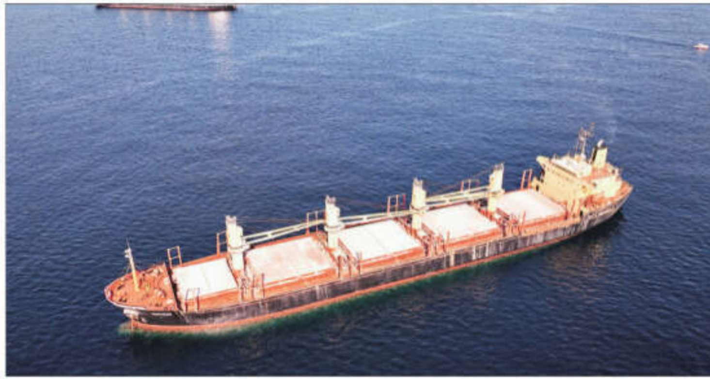
Cargo ship Rubymar

THE RUBYMAR CARGO ship, attacked last month, has sunk in the southern Red Sea, Yemen's internationally recognised government said in a statement on Saturday. If verified, it would be the first vessel lost since Houthi militants began targeting commercial shipping in November.