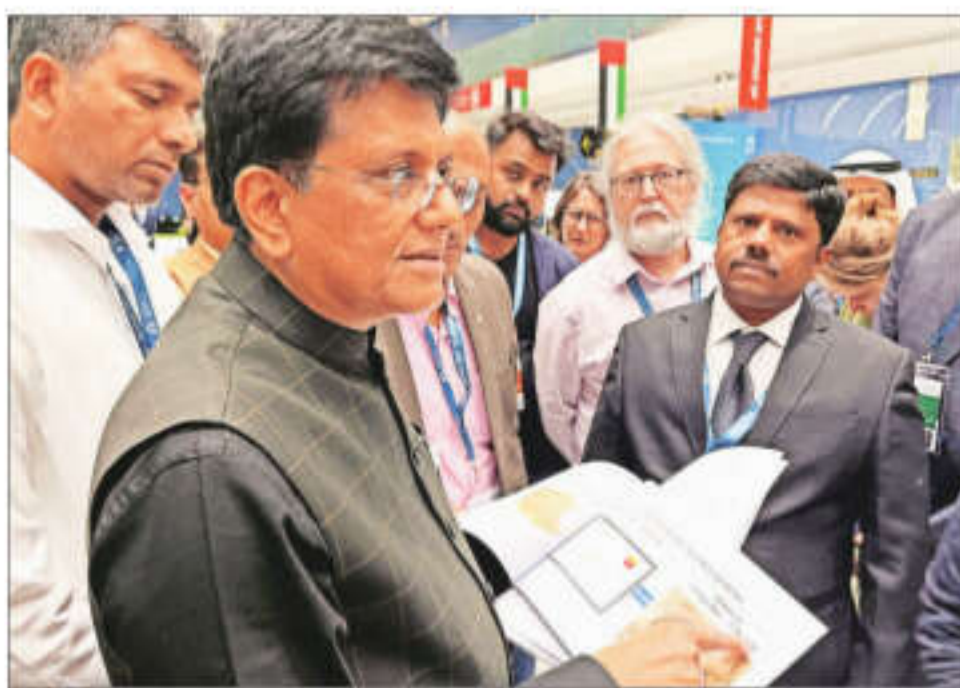
Commerce minister Piyush Goyal at WTO biennial gathering of ministers in Abu Dhabi, UAE

It decided to extend the moratorium on taxation of cross border electronic transmissions for another two years but could not take any decision on a permanent solution on public stockholding of food grains for food security and fisheries subsidies which were key Indian demands. Lack of decision on public stockholding at the meeting, however, does not impact government procurement of food grains and