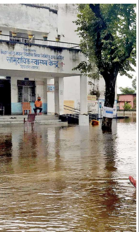
an Bihar in 2021 pt

'Unsurprising' improvements The researchers studied the performance of 241 health centres – 26 CHCs, 65 PHCs of 241 health centres – 26 CriCs, 65 PHCs and 150 sub-centres, spread across Bihar (23), Chhattisgarh (36), Himachal Pradesh (45), Jharkhand (37) and Rajsarhan (100). They referred to data from two studies from two different decades, one in 2002 and one in 2013, conducted in Udaipur and parts of Bihar, Jharkhand, and Himachal Pradesh. Centres from the 2013