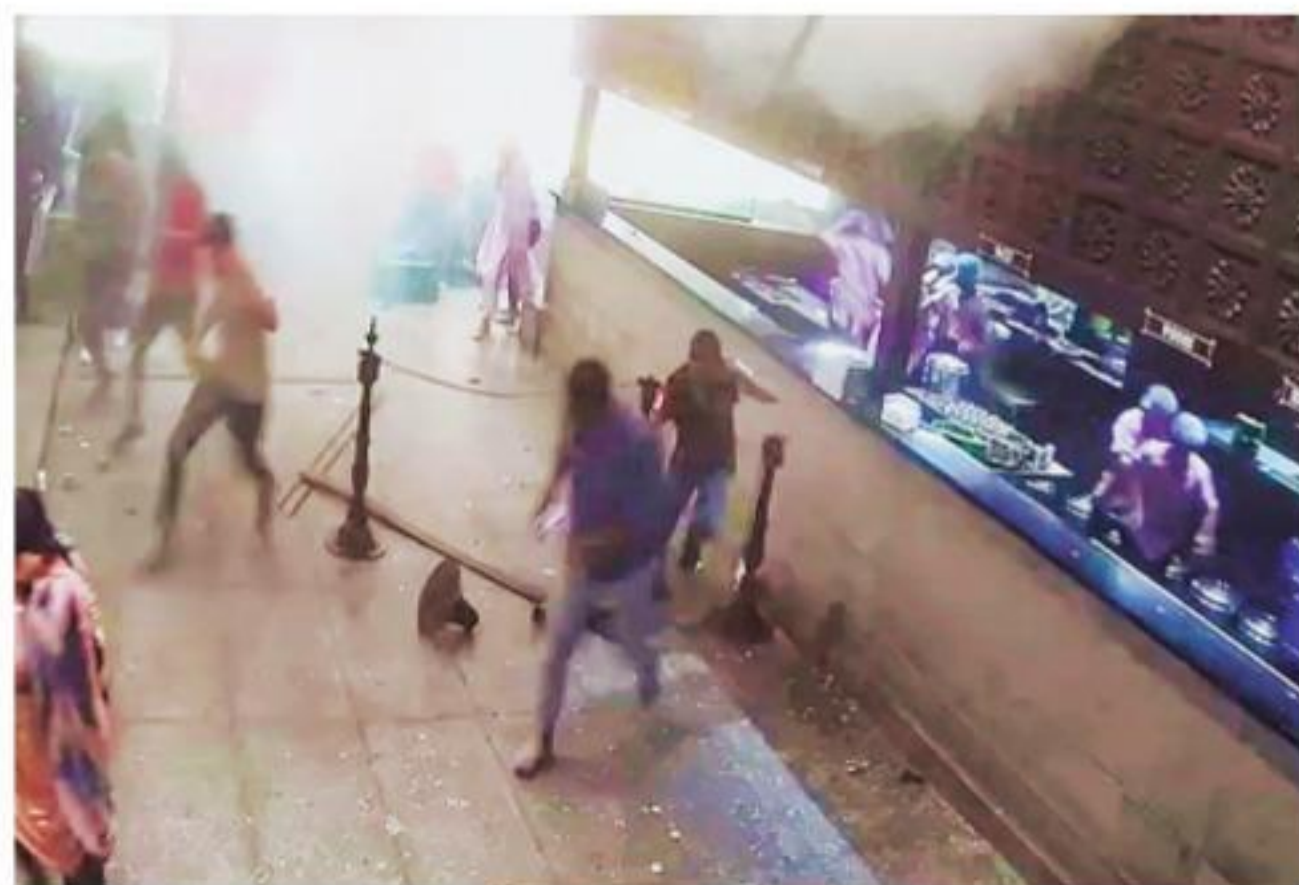
(Left) A CCTV grab showing the blast at Rameshwaram Cafe in Bengaluru's Whitefield area on March 1; at the reopening ceremony on Friday.