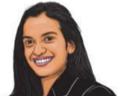
P V SINDHU

Toriyama's manga company said in a press note that at the time of his death, he had several works "in the middle of creation". Goku died many times, only to be resurrected because of "unfinished business" – an irony that would resonate with Toriyama's legions of fans.