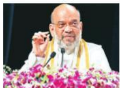
Union Home Minister Amit Shah in New Delhi on Friday.

Addressing an event, Shah said the Centre has introduced 20 new activities to be associated with PACS, enabling them to generate profits. The computerization of PACS has opened up many possibilities for their development, he said. Shah launched the National Cooperative Database and released the 'National Cooperative Database 2023: A Report'. The database aims to identify and address the gaps through a comprehensive analysis.