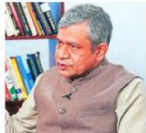
Union minister Ashwini Vaishnav

AI chipsets include graphics processing units (GPUs) and other computing hardware essential for creating AI models as