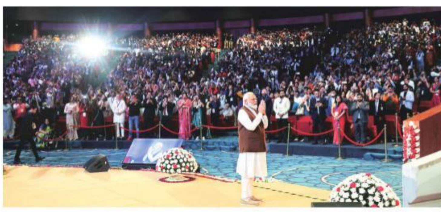
Prime Minister Narendra Modi at Bharat Mandapam in New Delhi on Friday.

Over the next two hours of the event Friday morning, as the Prime Minister presented awards to 21 content creators, it was clear that formal structure had to give way to irreverence. By interacting with influencers individually before giving them awards, PM Modi also gave them ample content for their reels -- full of humour, wit, and repartee, even personal anecdotes -- the kind of