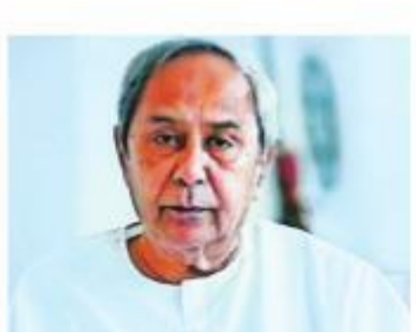
BJD chief Naveen Patnaik

State BJP leaders, who have been taking on the BJD as the main opposition in Odisha, are trying to persuade the central leaders that there is strong anti-incumbency against the ruling state party on the ground, and that the BJD would do well even on its own. Hence, they argue, first contesting in an alliance and then agreeing to less than