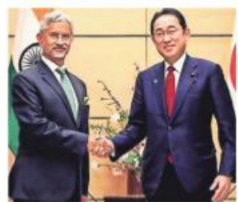
EAM S Jaishankar with Japanese PM Fumio Kishida in Tokyo on Friday.

countries and then put before the G20 a set of issues which were their collective views," said the Foreign Minister. "Within Asia and Africa, Global South is very popular. They know exactly what is happening, who's speaking up for them, and how their issues are getting on the table...The two summits which we convened last year, I don't believe China was present," he said.