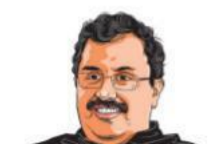
RAM RAJYA BY RAM MADHAV

As even liberals become uncomfortable with radical left, political flavour of the season has changed, including in India