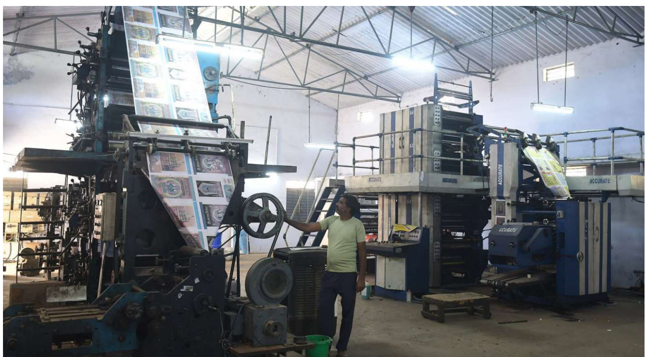
ent inviting printers from outside Andhra Pradesh to ta up textbook printing work. K.V.S. G