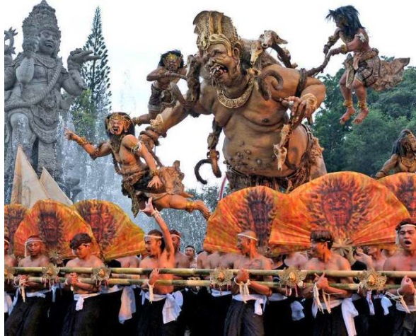
Fresh start: Hindu youth lift up an ogoh-ogoh effigy, symbolising the evil spirit, during the Kasanga Festival held to welco day of silence for self-reflection marking the Balinese Hindu new year. in Denpasar. Indonesia on Friday.

he said, stressing that the international community "must pool its strength in a reunification with Washington for creating an