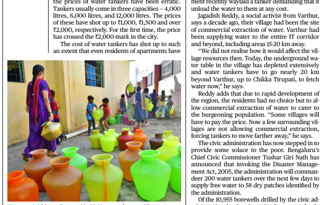
nen and children collect potable drinking water from a public tap at Indahalli off Mysuru road, in Bengaluru. The water is supplied by th galore Water Supply and Sewerage Board. K. MURALI KUMAR Navandahalli off My

The cost of water tankers has shot up to such extent that even residents of a