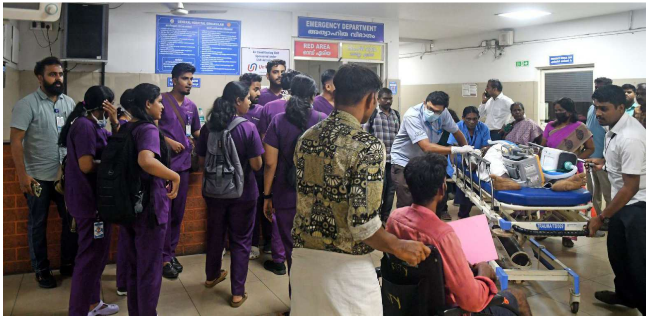
Despite not receiving stipend, foreign medical graduates pursuing internship at General Hospital, Ernakulam, play a key role in the health care services being offered by the institution. H. VIBHU