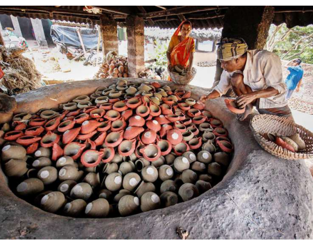
Clay craft: Potters prepare earthen lamps for sale ahead of the Maha Shivaratri festival, in Bhuba