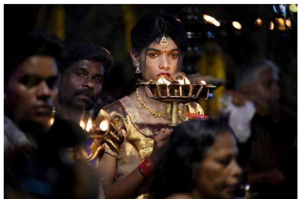
Patient prayer: Many families come together to mark the sacred occasion.