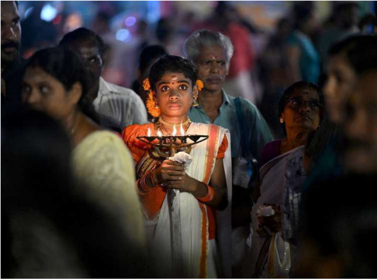
Sacred flame: A boy with a ceremonial lamp at the Kottankulangara Bhagavathy Temple in Kollam, Kerala, on March 24.