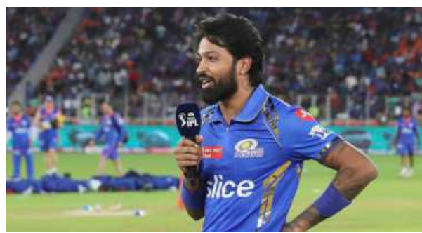
R. Ashwin came out in vehement support of the besieged Hardik Pandya after the MI captain was subjected to boos from the fans. Ashwin blamed this to the prevailing atmosphere of "fan wars" and "cinema culture". "Fan wars should never go this ugly. One should remember which country these players represent."