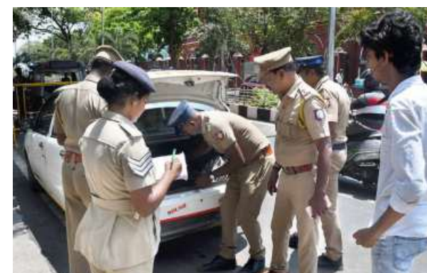
A flying squad inspecting a vehicle in Chepauk in Chennai.

A control room has been opened in every district. Once a complaint is