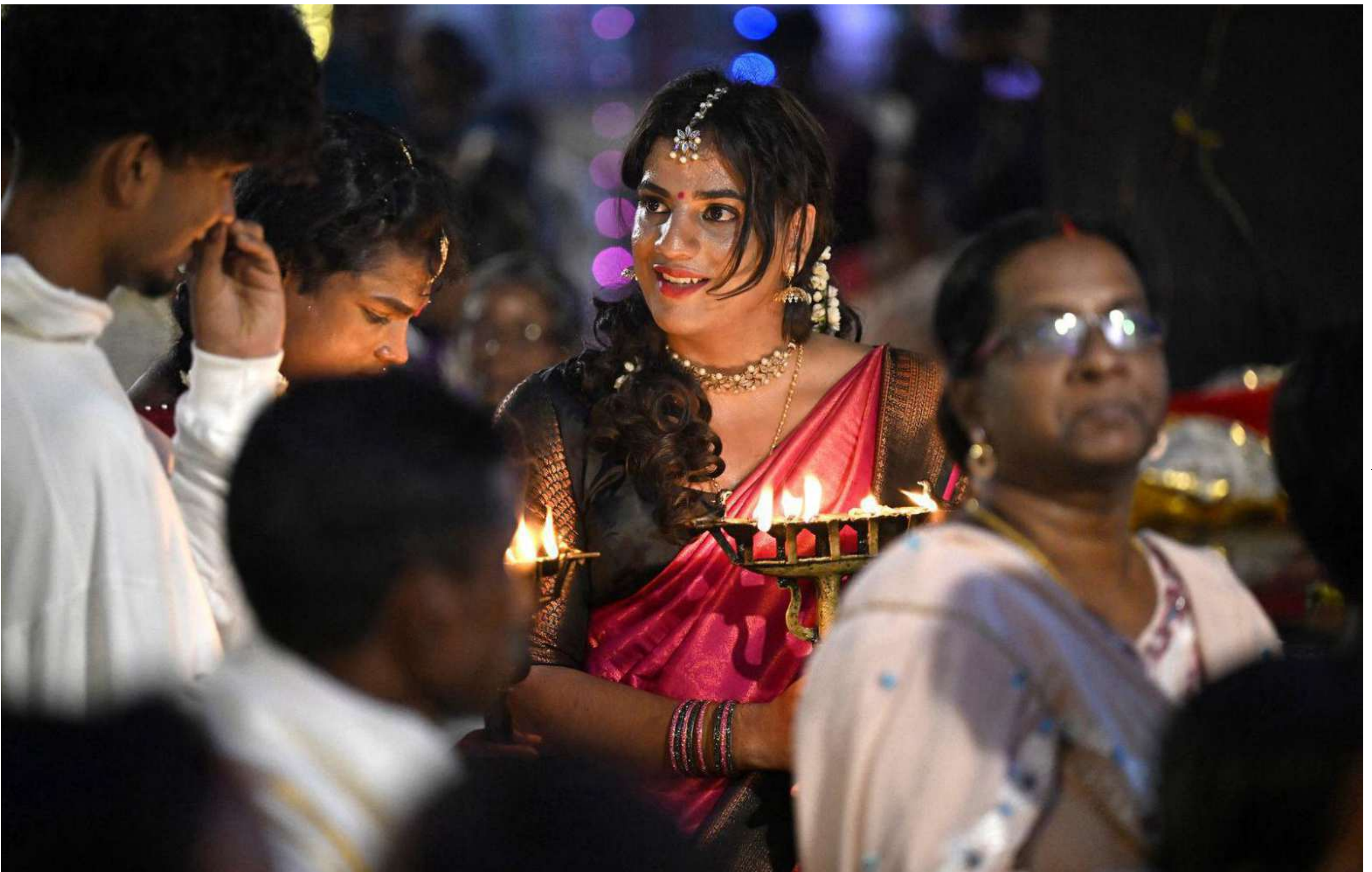
Gracious look: Men attired in sarees and decked in jewellery participate in the rituals and procession.