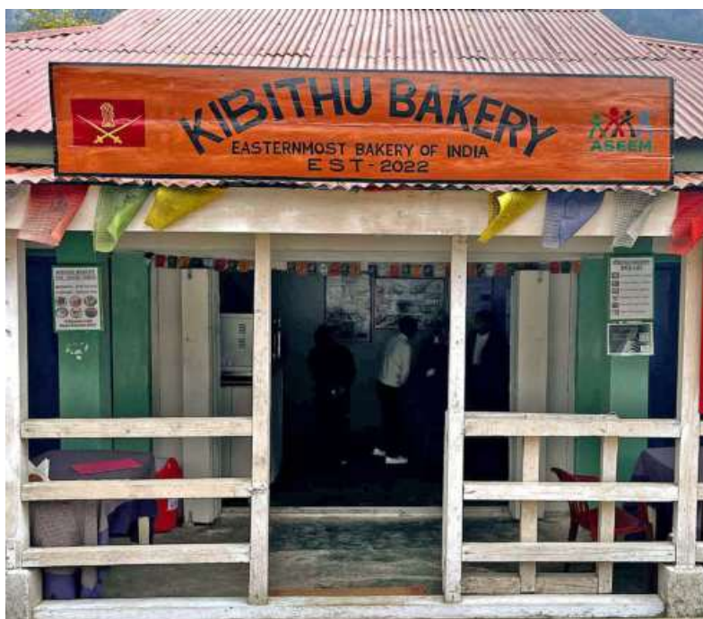
Building bridges: A Class 70 bridge near Parasuram Kund, which provides an alternate axis for movement to Kibithoo; and (right) Kibithoo Bakery, which was established by the Army in 2022. DINAKAR PERI