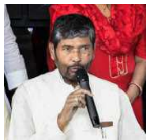
Pashupati Kumar Paras made a statement on the social media site X. FILE PHOTO

Former Union Minister Pashupati Kumar Paras on Saturday made it clear that he will "continue to support the NDA" in the Lok Sabha polls, but fell short of calling a truce with nephew Chirag Paswan.