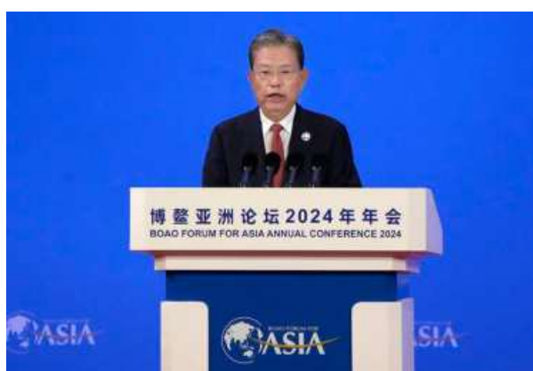
New vision: Zhao Leji speaks at the opening ceremony of Boao Forum of Asia in southern China's Hainan province on Thursday.

Speaking at the same session, on March 28, Sri Lankan Prime Minister Dinesh Gunewardane, said