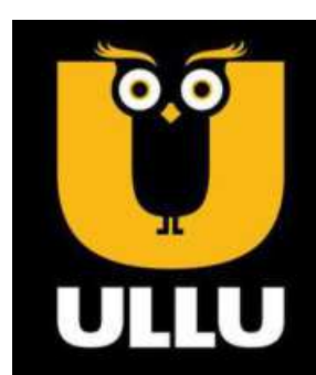
The Ullu app has been cleansed of much of the content it has built its business on.

These sites include "Hot Shots VIP," Mojflix, MoodX, and Uncut Adda". While there is no explicit ban on pornography in India, many international websites offering such content have been ordered ofline by the Uttarakhand