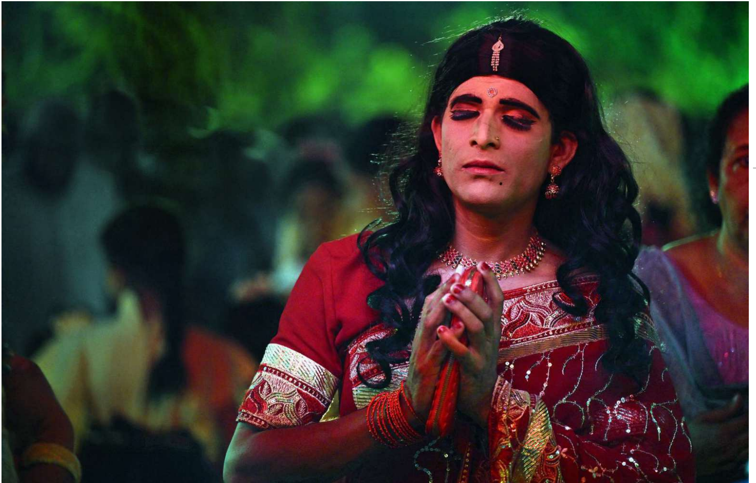
Peace and poise: It is believed that the feminine touch propitiates the Goddess Bhagavathy and brings her blessings to all.