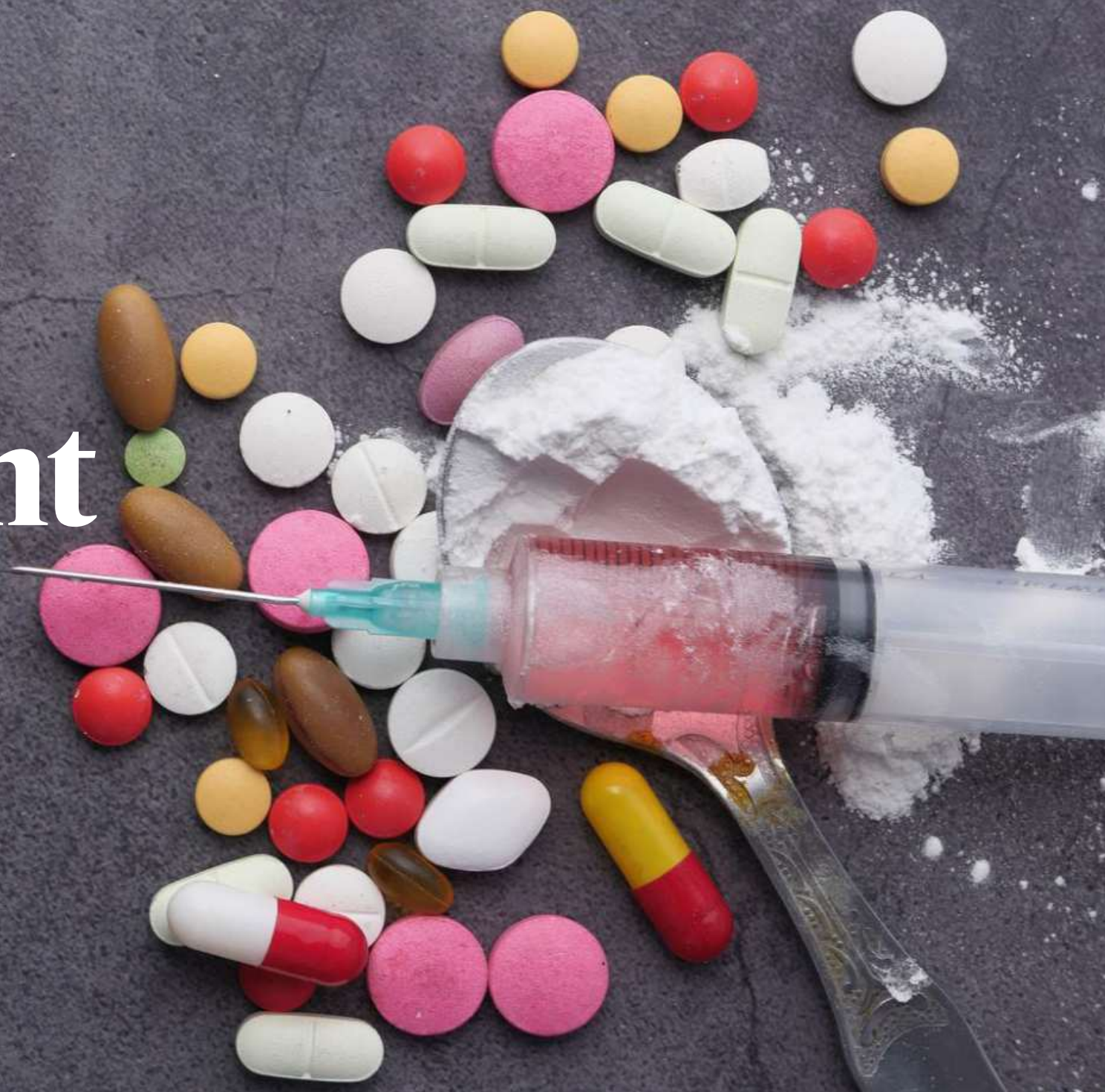
Counterfeit medications, also known as spurious drugs, are illicitly manufactured medicines designed to mimic legitimate products, often those belonging to well-established brands. These fraudulent drugs may even display fabricated information about non-existent manufacturers.