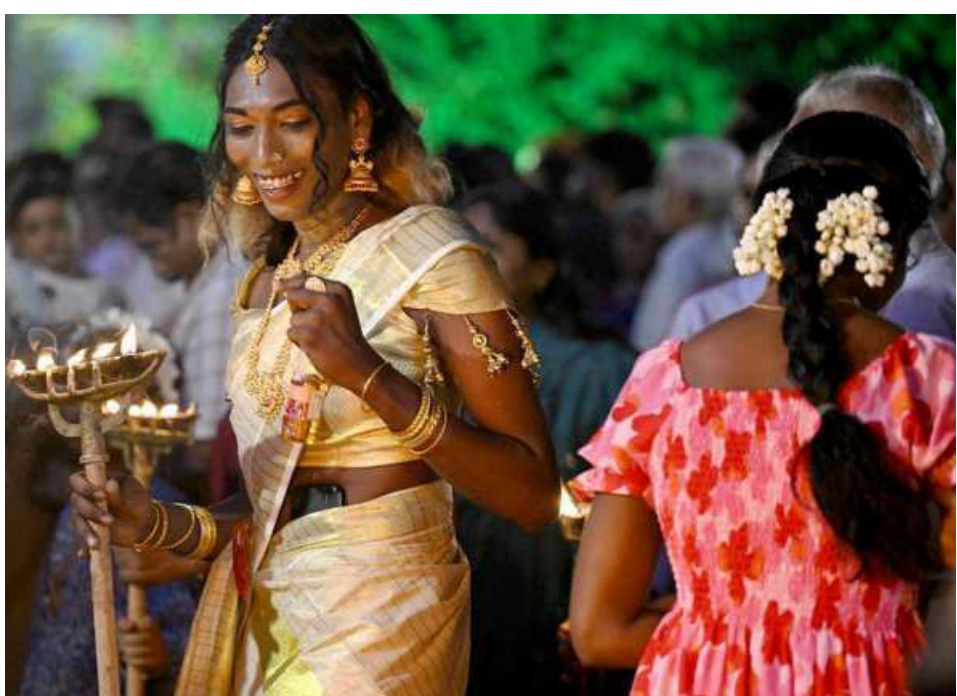
Lighter moments: The festival procession is older than any pride march.