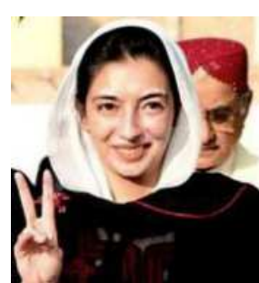
Aseefa Bhutto Zardari

Ms. Aseefa Bhutto Zardari, 31, who is set to become