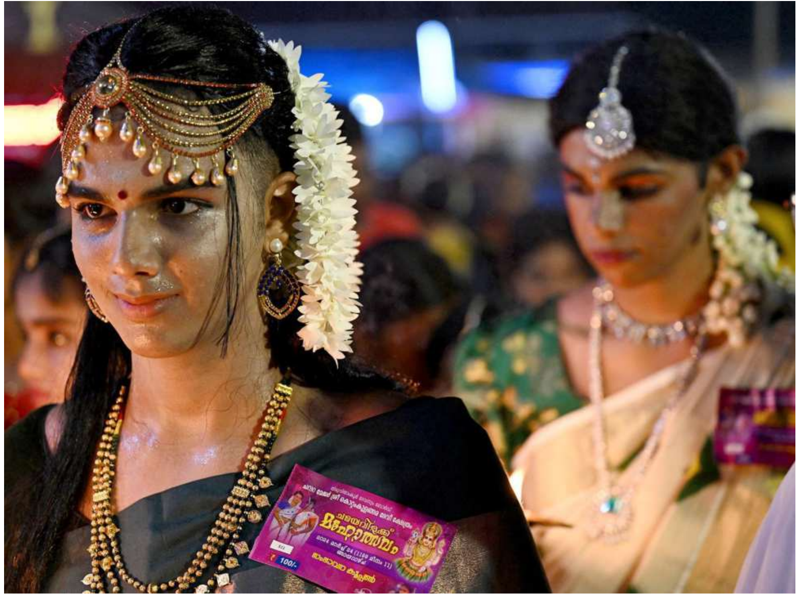
Floral adornment: Apart from jewellery, strands of flowers are also part of the finery worn by the male devotees.