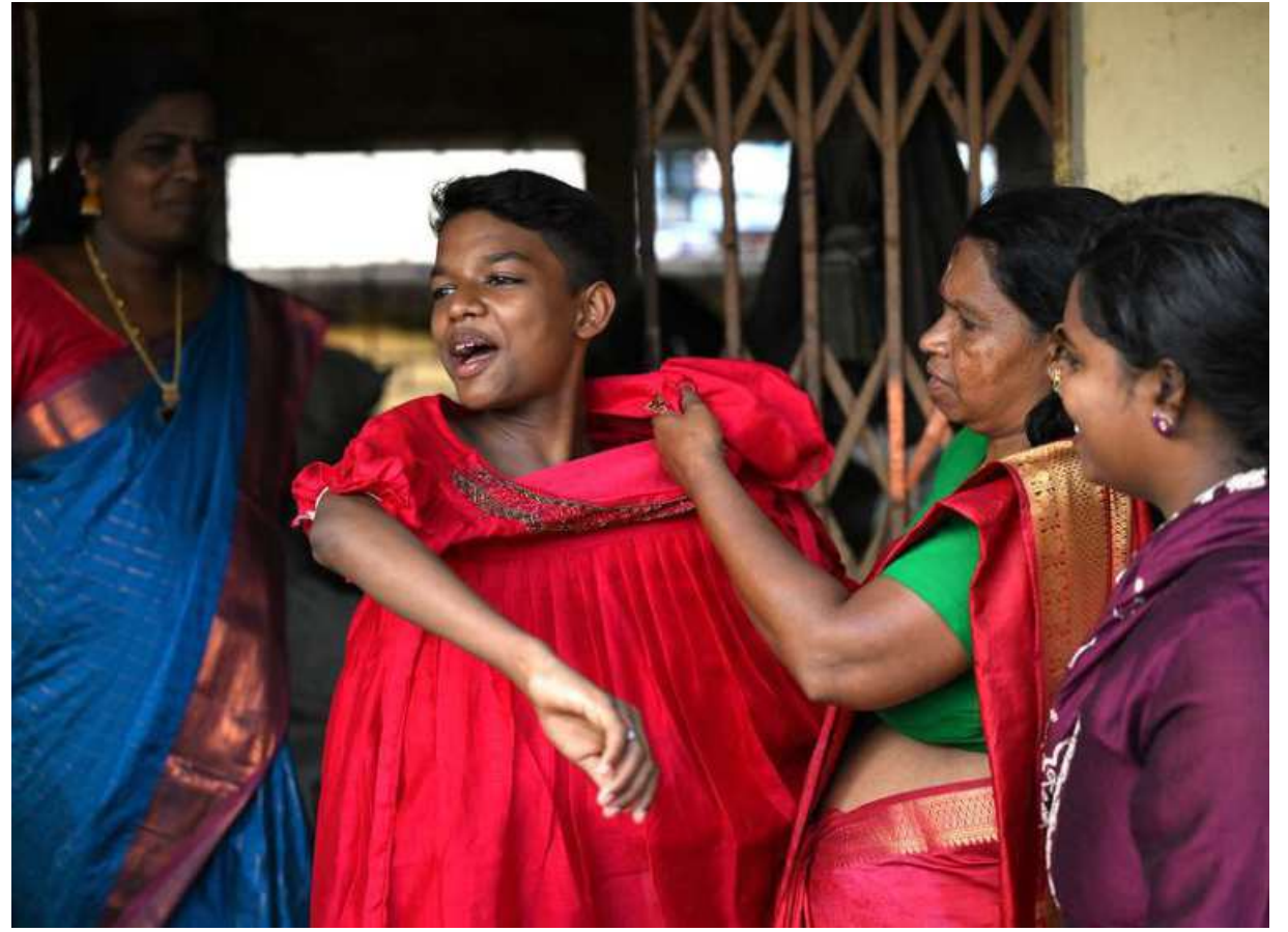
Getting ready: Family members help a boy get dressed before going to offer prayers at the temple.