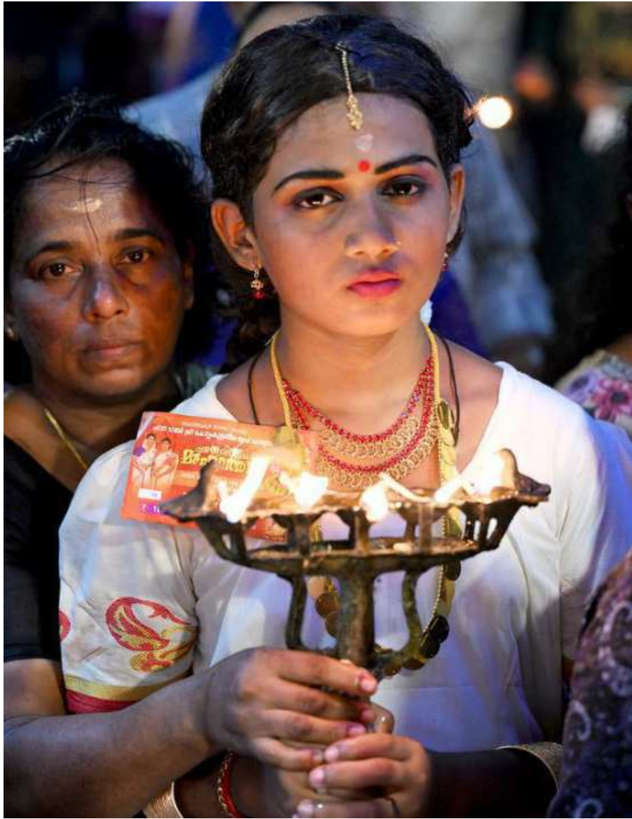
Devotional fervour: The traditional five-wick lamp is an important part of the festival.