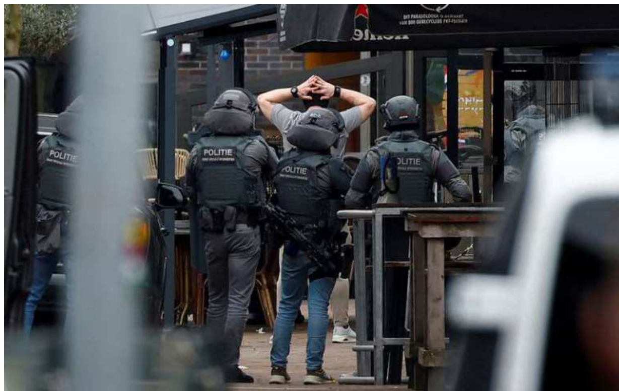
Dutch police officers detain a person near Cafe Petticoat, where several people were held hostage in Ede on Saturday. The suspect, who was previously known to police, had threatened the hostages with knives. Officials said there was no indication of a terrorist motive.