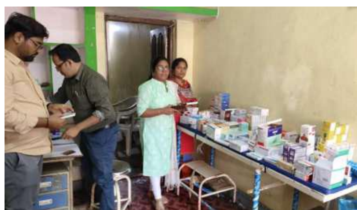
DCA team raiding a quack-run clinic from where they seized 59 varieties of medicines; (above) officials taking stock of the seized bottles of 'Saheth Care Powder', which claims to treat diabetes and hypertension, following a raid in Hyderabad.