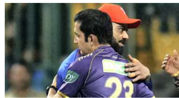
The IPL clash between RCB and KKR witnessed a heartfelt moment with Virat Kohli and Gautam Gambhir embracing each other. During RCB's encounter versus Lucknow in IPL 2023, Kohli and Gambhir got into a heated argument. In 2013, the two got into a heated fight, even pushing each other before being separated by teammates.