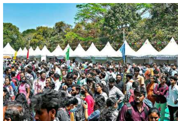
Crisis time: The trend of contractual appointments and clamour for consultancies are also blamed for the dip in formal jobs.

The report's authors have urged the government to take steps to increase agriculture productivity, create more non-farm jobs and promote entrepreneurship. Calling for a focus on policies that boost women's participation in the labour force, they also sought a minimum quality of employment and basic rights of workers across all sectors.