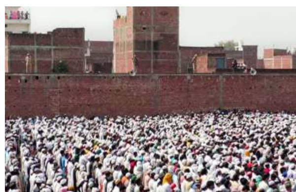
Supporters of Mukhtar Ansari take part in the funeral procession of the politician at Mohammadabad in Ghazipur on Saturday.

The district police faced difficulty in managing the crowd that tried to force its way into the burial ground where entry was restricted. Security personnel, in-