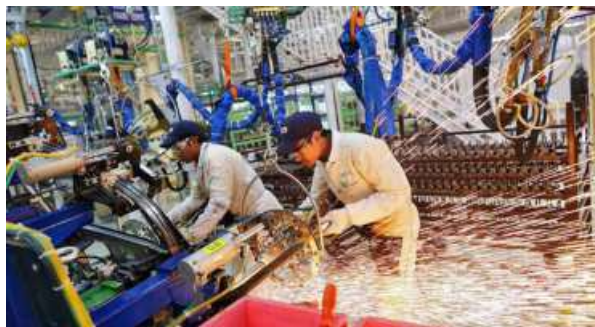
Payment rules: If MSMEs have a written agreement with a buyer, payments need to have been made within 45 days.

Section 43 b (h) of the Income Tax Act says payments due to UDYAN-registered micro- and small-scale industries would be allowed as deduction only if the actual payment was made within the time stipulated in the MSME Act.