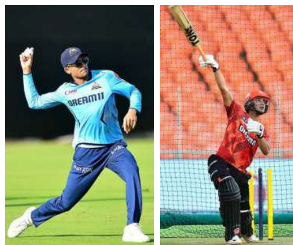
Aiming high: Gill will look to pull his weight while Abhishek will be keen to rock again.

For SRH, on the other hand, Abhishek Sharma, Heinrich Klaasen, Travis Head and Aiden Markram have been at their marauding best, helping their side breach the 200-run mark twice in succession.