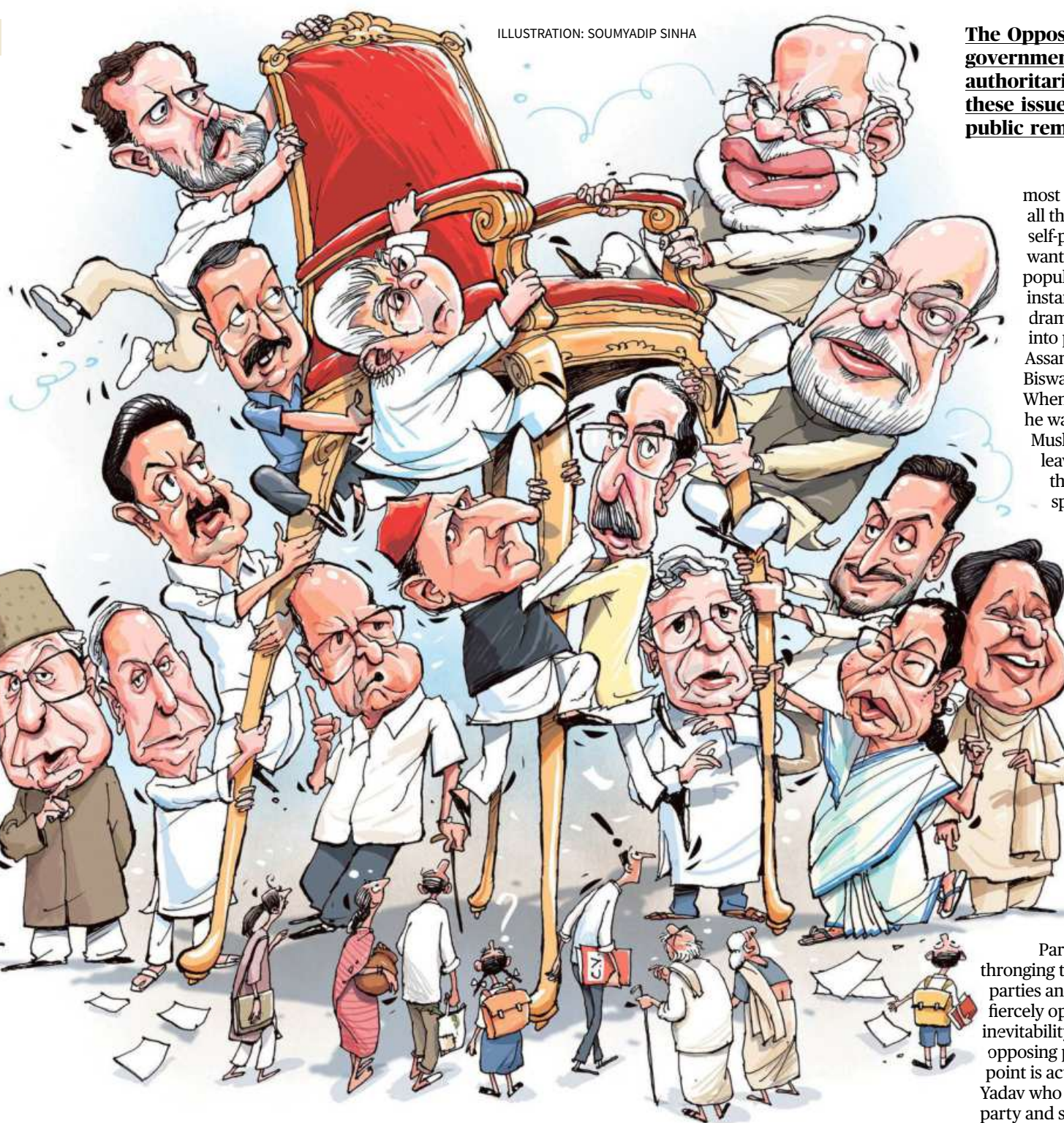
ILLUSTRATION: SOUMYADIP SINHA

All politics is based on some understanding of time periods. The BJP campaign focuses on the past follies of the Opposition; the party has rescued the country, but the best is yet to come, it says. The entire Opposition