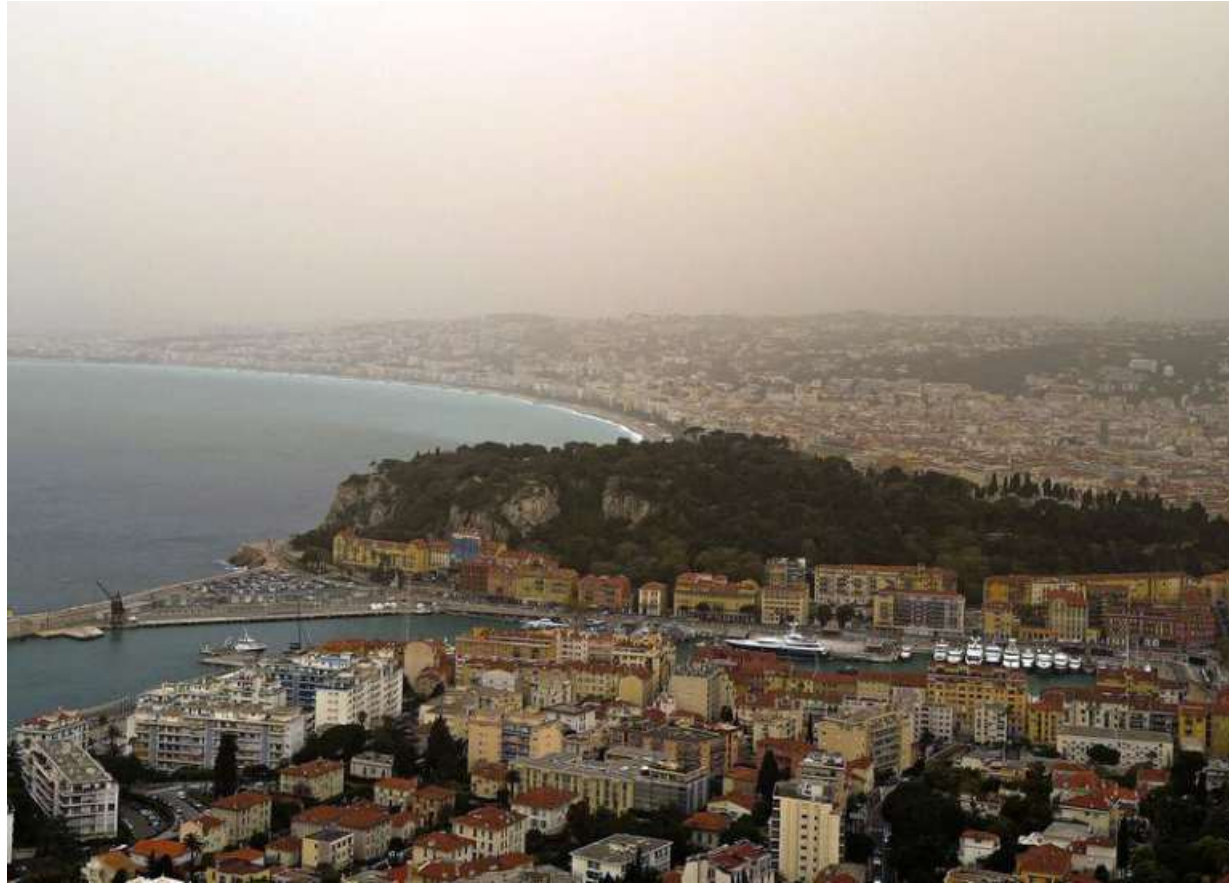
Across the seas: Sand dust has been blowing from the Sahara desert in North Africa since March 27 and giving the sky a yellowish appearance above the European Riviera city of Nice in southern France on Saturday.