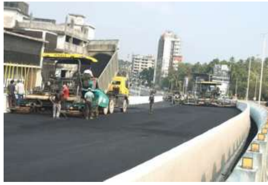
Poll pause: The govt. may end FY24 with the construction of only 94% of the targeted 13,814 km NHs. THE HINDU