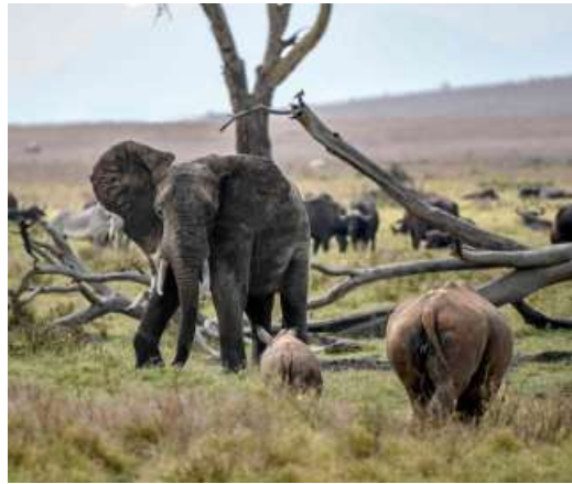
Kenya has been a major tourist destination, attracting visitors from all over the globe to its wildlife parks.