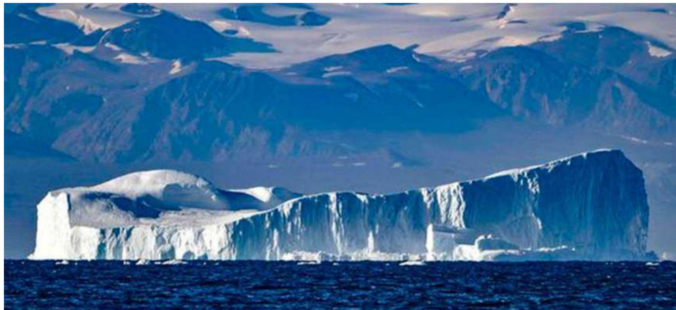
More than 1,000 billion tonnes of ice have been lost in the past four decades and not been accounted for, one study found. The INTERACT research stations in the Arctic are key to keeping track of such trends.

The researchers used multiple earth-system models (ESMs) to understand ecosystem conditions across the Arctic region. They focused on eight "essential variables" of the Arctic ecosystem, including temperature, vegetation, precipitation, and snow depth. ESMs are fully coupled climate, land, and ocean computational models that can be used to generate data for the entire planet. Those used in the study