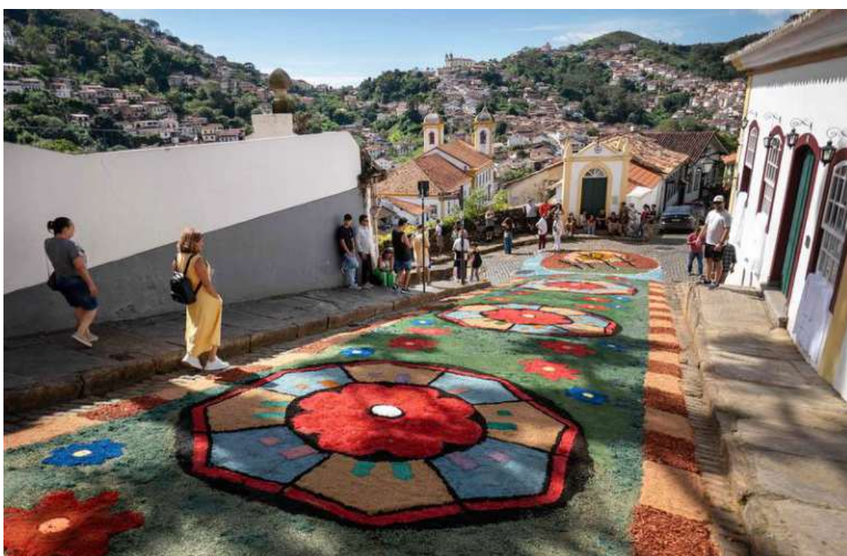
Sawdust rugs decorate a street in the historic city of Ouro Preto in Minas Gerais State in Brazil on Sunday. The streets are decorated by locals and tourists who use about 60 tonnes of coloured sawdust for a Easter procession representing the resurrection of Christ.