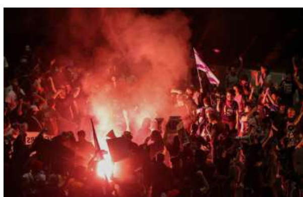
Seething rage: Protesters launch a prolonged demonstration in front of the Knesset in Jerusalem on Sunday.

Israeli society was broadly united immediately after October 7, when Hamas killed some 1,200 people during a cross-border attack and took 250 others hostage. Nearly six