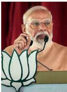
Prime Minister Narendra Modi addressing a public rally in Meerut on Sunday.

have grabbed your money will have to return it." He alleged that the corrupt were making the rounds of courts during his tenure. "They are targeting me but I am not afraid," Mr. Modi added. The 2024 election, he said, would be between those who want to save the corrupt and those who want to hold the dishonest to account. "It is not just the election to form a government but it is going to be a vote for a developed nation and third largest economy," he said.