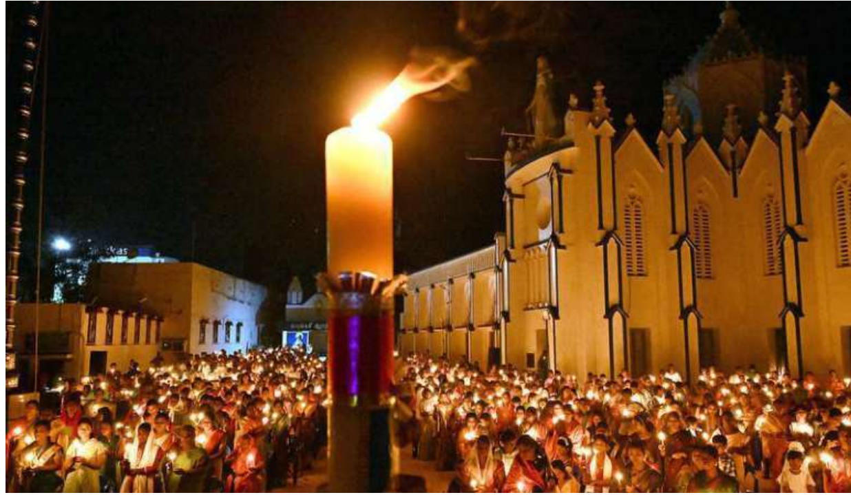
A midnight special prayer being held at the Holy Rosary Church in Ramanathapuram, Tamil Nadu on the occasion of Easter.