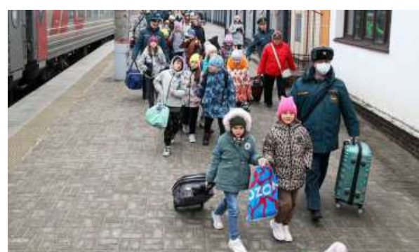
Outdoor lesson: Children being evacuated from Russia's Belgorod region on Sunday due to Ukrainian artillery and drone strikes.

Meanwhile, hundreds of thousands in Ukraine's Odesa region were left without power on Sunday after debris from a downed Russian drone caused a