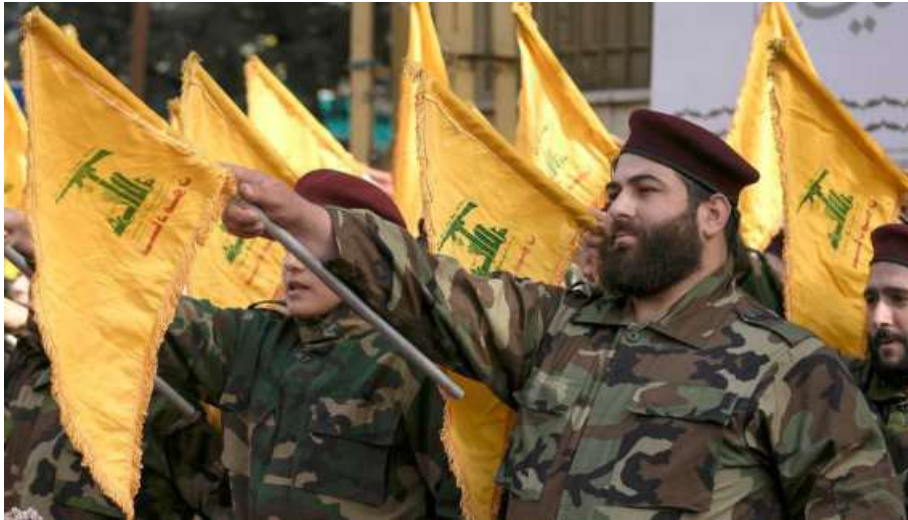
Variables in play: Hezbollah began launching rockets at Israel from hilltops and villages in Lebanon in support of its ally Hamas after their cross-border attack triggered a fierce Israeli offensive in Gaza.

Hezbollah began launching rockets from hilltops and villages in southern Lebanon at Israel on October 8 in support of its Palestinian ally Hamas, which carried out a cross-border attack into Israel