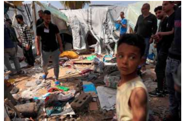
Scattered remains: Palestinians check the damage at a makeshift camp in front of al-Aqsa Martyrs Hospital on Sunday.

strikes. Israel accuses Hamas and other militants of operating in and around medical facilities, and troops have raided a number of hospitals. Israeli strikes killed 77 Palestinians in Gaza in the past 24 hours, as Egypt hosted an Israeli delegation for a new round of talks in a bid to secure a truce with Gaza's Hamas rulers. Hamas would not be present at the talks in Cairo, an official said on Sunday, as it waited to hear from mediators on whether a new Israeli offer was on the table. The head of the World Food Program, Cindy McCain, told CBS on Sunday that WFP was able to get just nine trucks into Gaza on Saturday. "That's nothing. We just cannot continue this way," she said, calling for unrestricted access.