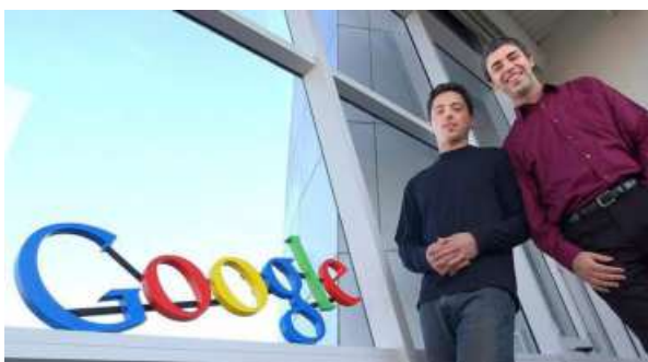
Trick done right: Google co-founders Sergey Brin, left, and Larry Page at company headquarters in California in 2004.

Gmail also came equipped with Google's search technology so users could quickly retrieve a tid-