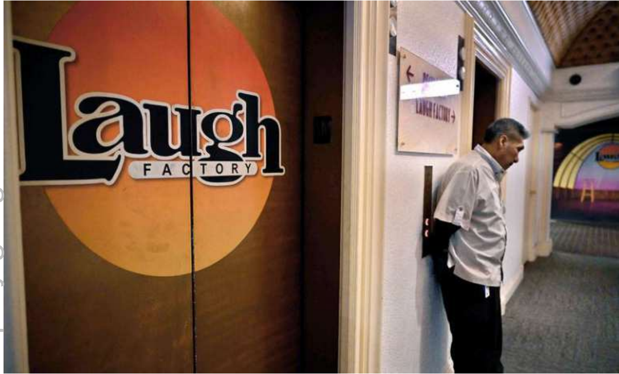
Can't bet on future: A worker waits for an elevator at the Tropicana Las Vegas in Las Vegas, Nevada. The hotel-casino opened in 1957 and will close on April 2 to make way for a planned $1.5 billion, 33,000-seat domed stadium for Major League Baseball's Oakland Athletics and a related resort development by Bally's and Gaming and Leisure Properties Inc. MLB owners approved the team's relocation to Nevada in November and the A's hope to move into the ballpark, which will occupy nine acre of the 35-acre site, in 2028.