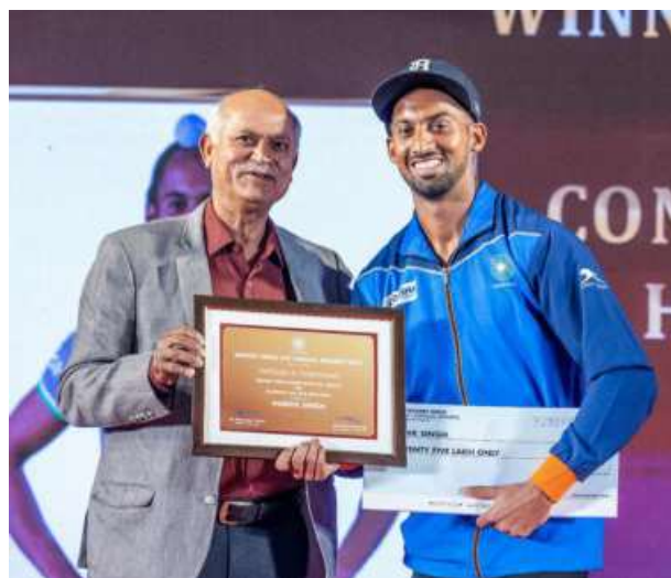
Best in the country: Hardik and Salima receiving the Balbir Singh Sr. Award from Zafar Iqbal and Harbinder Singh.