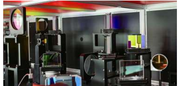
Precision game: Partial view of the special mirrors systems used to activate laser at the ELI project in Romania.

France's Gerard Mourou and Donna Strickland of Canada won the 2018 Nobel Physics Prize for harnessing the power of lasers for advanced precision instruments. "The sharp beams of laser light have given us new opportunities for deepening our know-