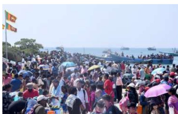
Pilgrims from Sri Lanka and India leave Katchatheevu island after the festival of St. Anthony's Church on in March 2023.

working for 75 years and counting". The news report was based on replies received under a Right to Information (RTI) query filed by BJP Tamil Nadu chief K. Annamalai, on the ceding of the island situated in the Palk Strait to Sri Lanka by India in 1974. The RTI replies give details over the conflicting claims on the island, with Sri Lanka (then-Ceylon) pressing its claims soon after Independence, as detailed in the news report, with the Opposition even during Prime Minister Jawaharlal Nehru's time questioning the Government of India for being in-