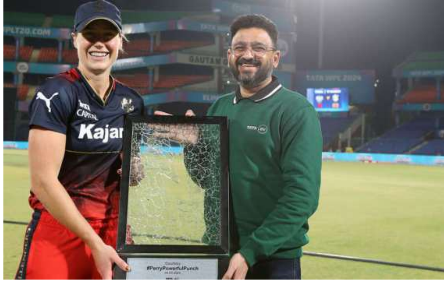
Adding punch: Ellyse Perry during the eliminator match of the Women's Premier League 2024 between Mumbai Indians and Royal Challengers Bangalore.

This reminded me of an interesting tactical marketing campaign food-deliv-