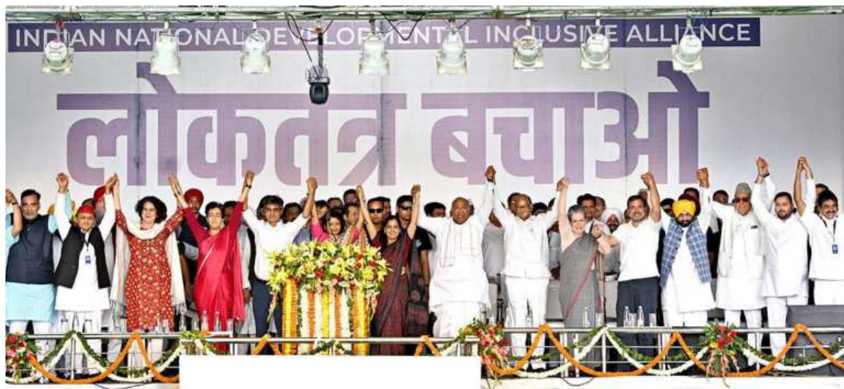
Call for change: Leaders of INDIA bloc attend the Loktantra Bachao rally at Ramlila Maidan in New Delhi on Sunday.

U nder the banner of "Loktantra Bachao" or "Save Democracy", leaders of the Indian National Developmental, Inclusive Alliance (INDIA) stood united at the Ramlila Maidan on Sunday in solidarity with Delhi Chief Minister Arvind Kejriwal and former Jharkhand Chief Minister Hemant Soren, who were arrested in separate cases by the Enforcement Directorate. The bloc also laid down their 2024 Lok Sabha election pitch, calling it a "fight to save the Constitution".