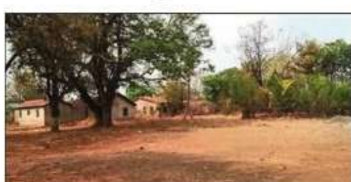
The extended Pawar family used to gather for lunch first and then head to the ground where Sharad Pawar addressed the crowd of supporters

forced to find an alternative venue for their final election rally on May 5 on their home turf.