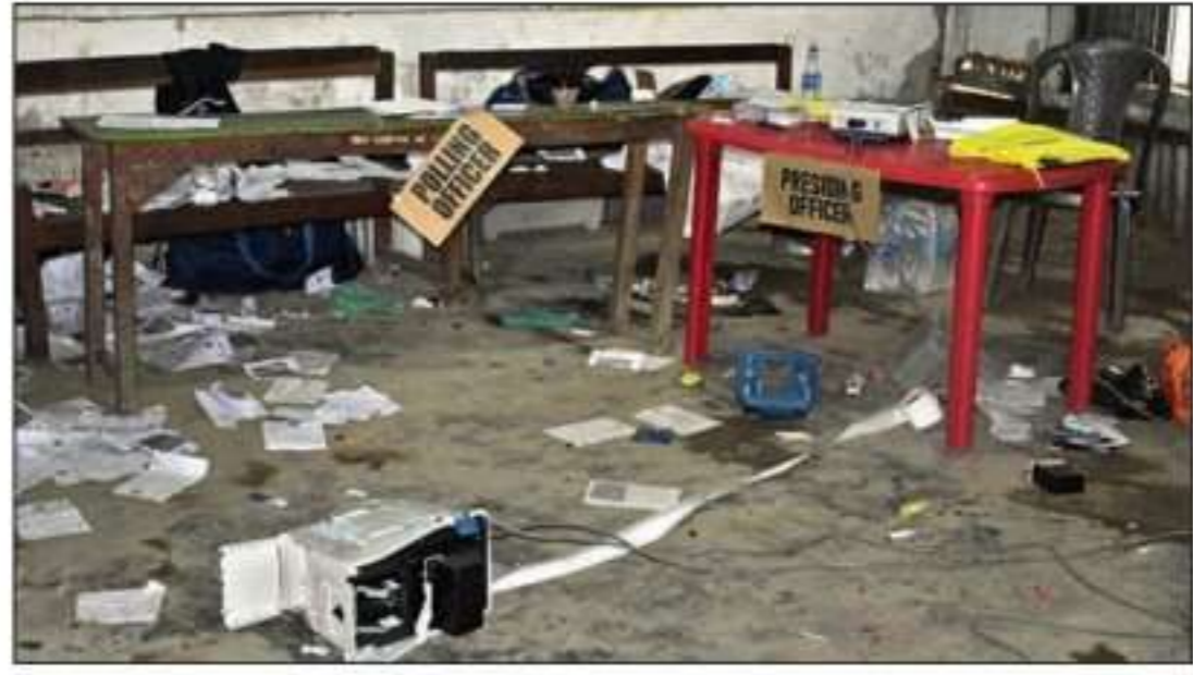
A vandalized polling station at Khurai in Manipur's Imphal East on Friday

The run-up to the polls was subdued, with minimal campaigning by the principal contenders in the BJP-governed state. Home minister Amit Shah's April 15 rally was the only large campaign activity of the election.