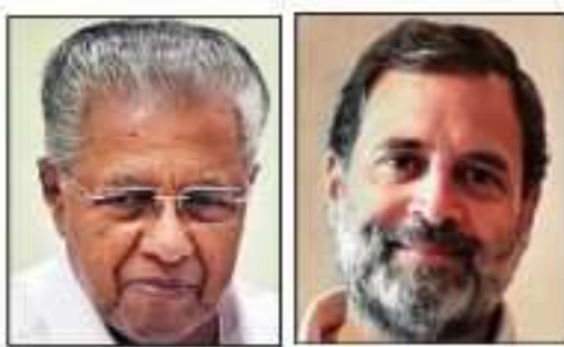
Pinarayi Vijayan & Rahul Gandhi

Left leaders are not like former Congress leader Ashok Chavan, who joined BJP after reportedly saying that they cannot go there (to jail),