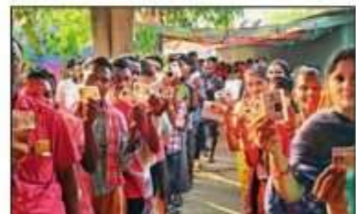
BIG BOOST IN RED ZONE

Voting started at 7am. It was after 9.30am that polling