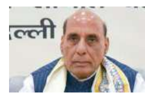
Like dinosaurs became extinct. Cong. will also become extinct. After years, if names are mentioned in front of children, they will ask what is Congress RAJNATH SINGH Defence Minister