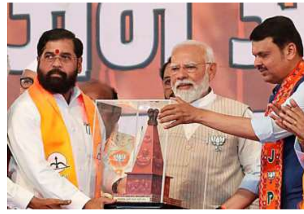
Narendra Modi being felicitated by Eknath Shinde and Devendra Fadnis at Latur in Maharashtra on Tuesday.

Addressing a poll rally in Latur district in the Marathwada region, Mr. Modi mocked the alleged ineffectiveness of previous Congress-led governments. "During the Congress regime, news headlines used to be about India handing over another dossier to Pakistan about terror activities and terrorists. It used to be big news. Some of our friends in the media used to clap after any such dossier was sent," he remarked, commenting on the situation post the 2008