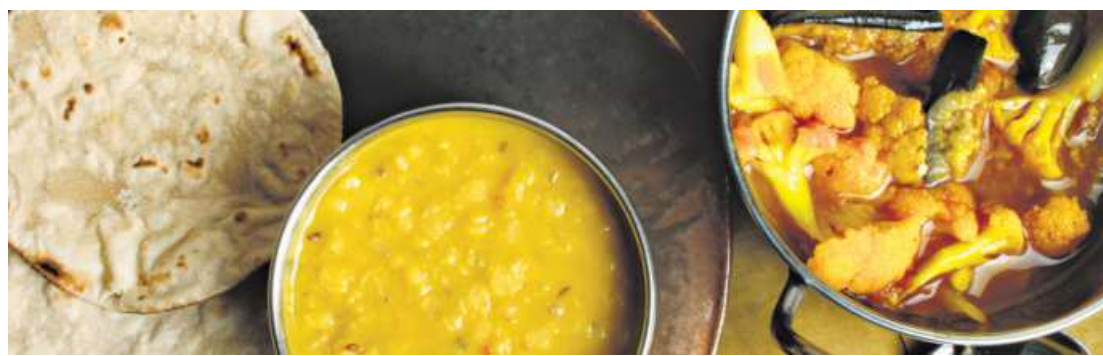
^ Sunflower oil All figures in ₹ except those in Column A (grams)

The tables are constructed based on data sourced from the Department for Consumer Affairs, National Horticulture Board, Periodic Labour Force Survey, and Report on District Level Estimates for the State of Maharashtra