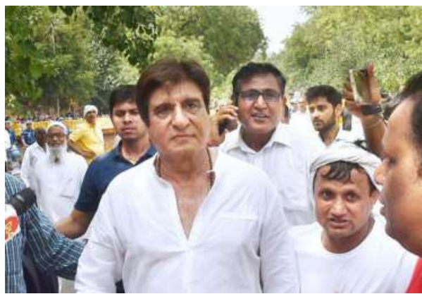
Raj Babbar, who has earlier been party's Lok Sabha and Rajya Sabha MP from U.P., is pitted against BJP's Rao Inderjit Singh.