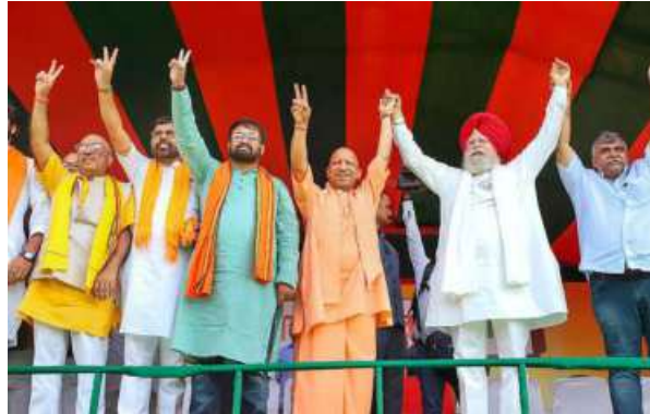
Change in tone: Uttar Pradesh Chief Minister Yogi Adityanath at an election rally in Asansol, West Bengal on Tuesday.

Addressing election rallies for the BJP candidates from Baharampur, Asansol and Birbhum Lok Sabha seats on Tuesday, Mr. Adityanath raised the issue of violence during the Ram Navami procession on April 17. "Had such inci-