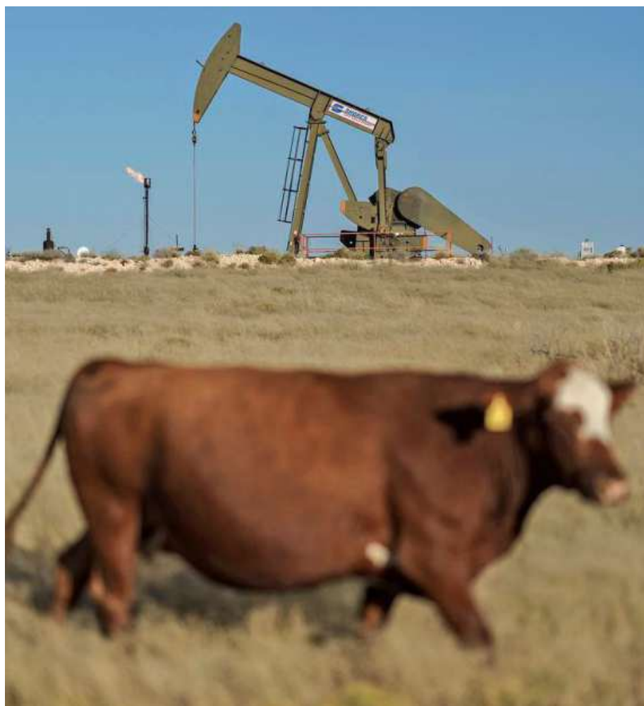
A cow walks through a field as an oil pumpjack and a flare burn off methane and other hydrocarbons in the background in the Permian Basin, Texas. Methanogenic bacteria thrive in oxygen-deficient environments, including the digestive tracts of animals. AP

global carbon cycle by converting organic matter into methane. While methane is a potent greenhouse gas, its production by methanogens is an essential part of natural ecosystems. But human activities like agriculture, dairy farming, and fossil fuel production have further increased methane emissions.