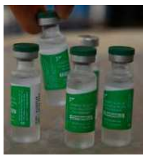
Doctors say any adverse event would have occurred within a month of the first dose.

A report in British newspaper The Daily Telegraph stated that in a legal document submitted to the High Court in London in February for a group action being brought by 51 claimants, AstraZeneca admitted that the vaccine de-