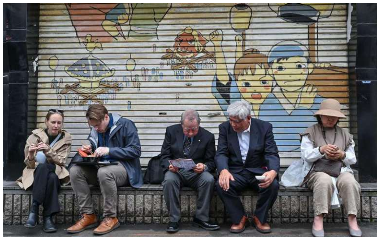
Currency play: A man (second from left) has lunch while sitting outside with other visitors in the tourist area of Tsukiji fish market in Tokyo as the country marks the 'Golden Week' holidays on Tuesday. While Japan is seeing record numbers of foreign visitors, the weakness of the yen, which fell to a new 34-year low against the U.S. dollar on April 29, is boosting consumption, delighting certain traders.