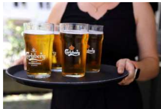
Bland drink: The company said revenue was negatively impacted by currency effects.