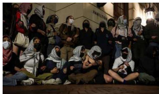
Protesters link arms outside Hamilton Hall barricading students inside the building, at Columbia University on Tuesday.