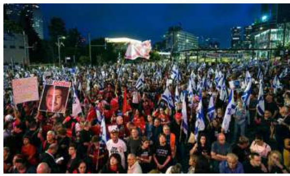
People protest against Benjamin Netanyahu's government and call for the release of hostages held in Gaza, in Tel Aviv on Saturday.

Mr. Netanyahu's comments came hours before U.S. Secretary of State Antony Blinken arrives in Israel to advance the truce talks - which appear to be one of the most serious rounds of negotiations between Israel and Hamas since the war began. The