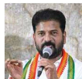
A. Revanth Reddy

Taking to X, the Chief Minister shared a similar notice issued by the OU authorities last year when BRS was in power. The notice contained information on closure of hostels due to summer vacation and also mentioned that hostels were being closed due to acute shortage of power and water.