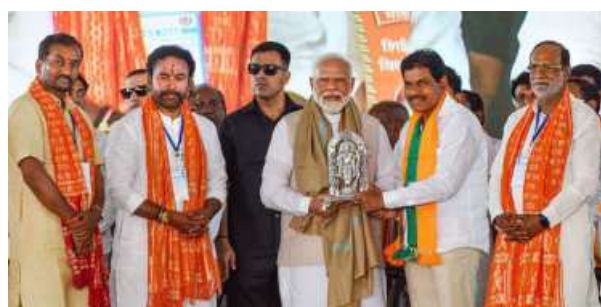
Prime Minister Narendra Modi with Union Minister G. Kishan Reddy and other leaders in Zaheerabad, Telangana, on Tuesday.

Beginning his marathon hour-long speech in Telugu – Na Telangana kutumba sabhyulandariki namaskaramulu (Greetings to my