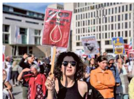
Protesters attend a rally against Iranian rapper Toomaj Salehi's death sentence in Berlin, Germany, on Sunday.