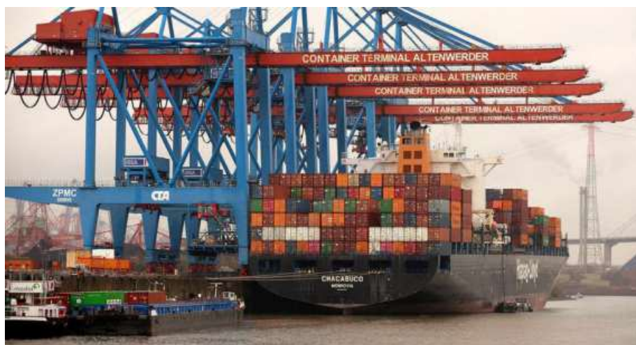
Ripple effect: Germany's logistics sector has protested that applying the law to companies that merely transport imported goods from ports within the country was unreasonable. FILE PHOTO

Their experience signalled what industries throughout the European Union may soon face, after the European Parliament last week passed the Corporate Sustainability Due Diligence Directive that will require larger companies operating in the bloc to check if their supply chains use forced labour or cause environmental damage and take action if they do.