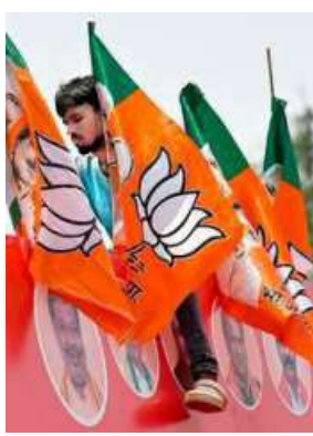
Modi asked the candidates to take on the Congress's 'divisive' agenda.

"dangerous ideas" like bringing in inheritance tax. Stressing that the current polls were "no ordinary election", he said: "They [Opposition] are bent upon taking away the hard-earned wealth of the people and giving it to their vote bank. The Congress has also made it clear that they will bring in dangerous ideas like inheritance tax. The nation must unite to stop them." "I send you my wishes for your victory in the election", the Prime Minister said.