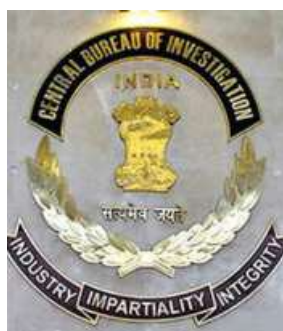
The State has not replied to questions about whether the sanction has been granted.

The chargesheet also revealed that the CBI had not made any fresh arrests in the case apart from the six accused first arrested by the Manipur Police after videos of the incident went