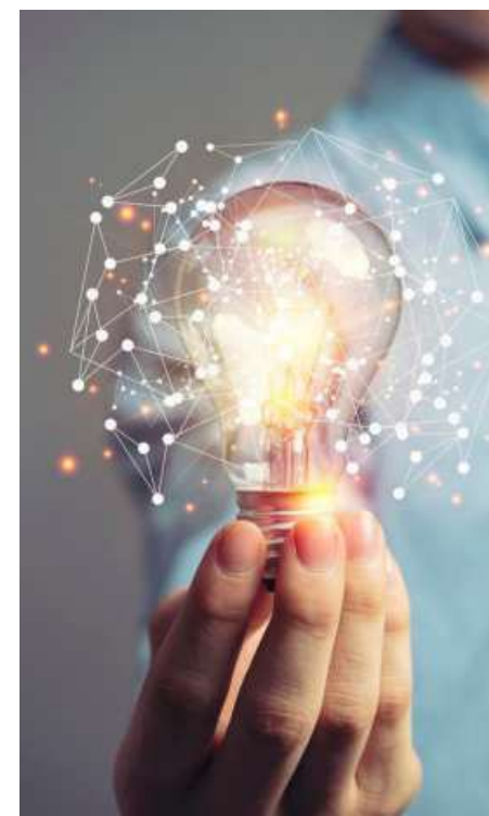
FROM THE ARCHIVES