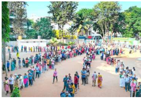
The Opposition also expressed worry over the 5.75% jump in voter turnout between initial numbers and final figure for phase 2.

During the last general elections in 2019, the first