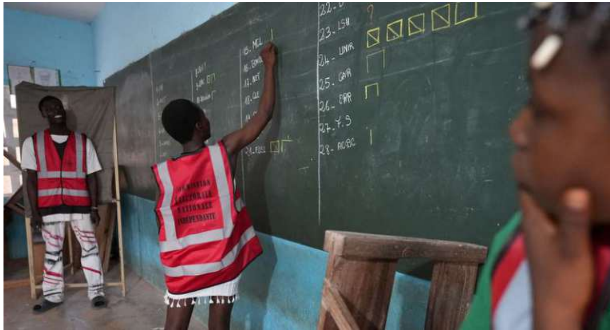
Electoral officials count votes at a polling station in Lome on April 29, 2024, during Togo's legislative elections.