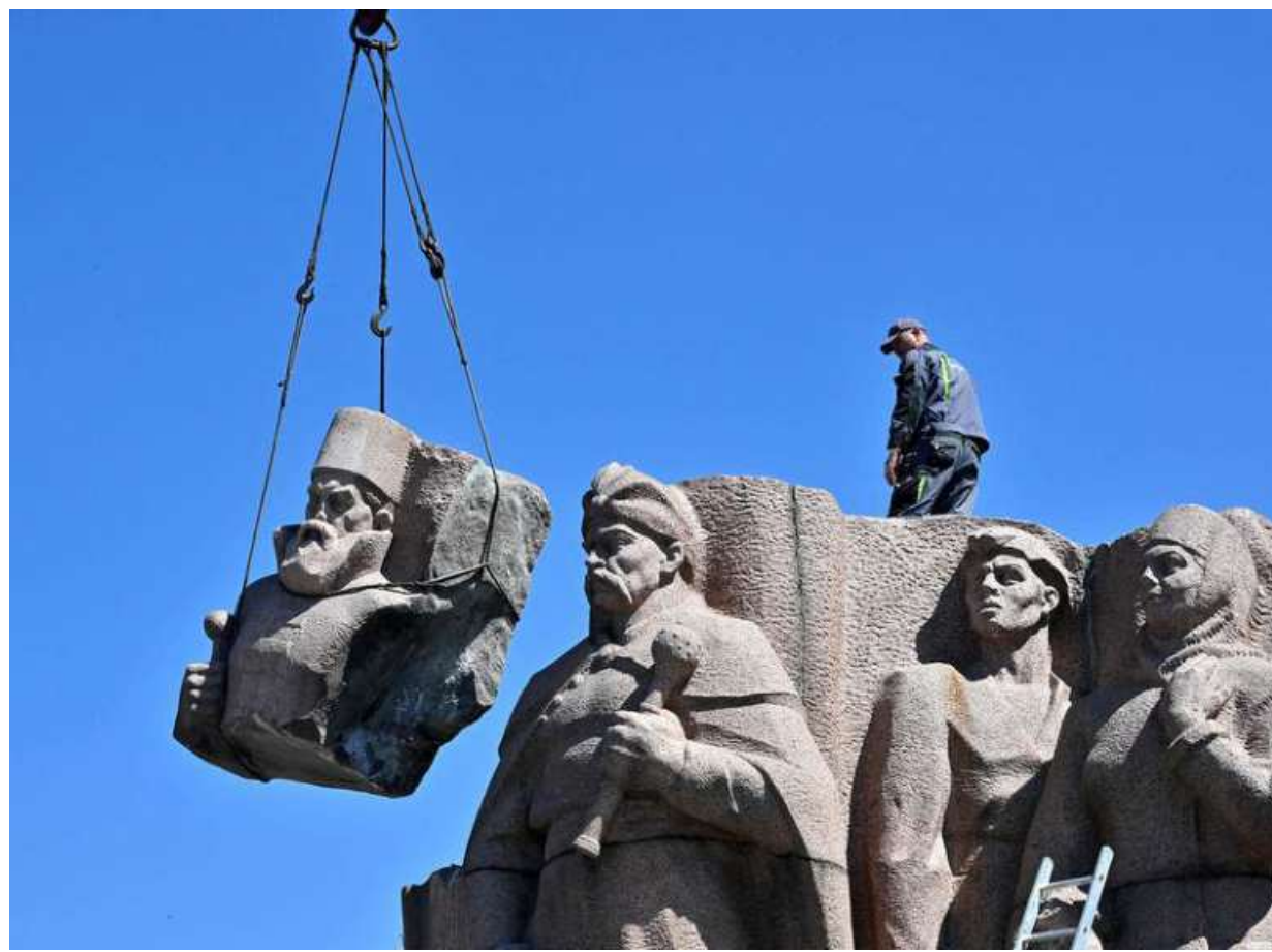
Demolition drive: Workers dismantle a Soviet-era monument to the Pereiaslav Agreement on Ukraine-Russia union, in Kyiv on Tuesday.