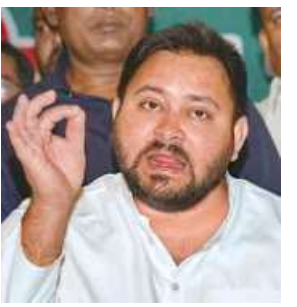
RJD leader Tejashwi Yadav.

The JD(S) has suspended Mr. Revanna from the