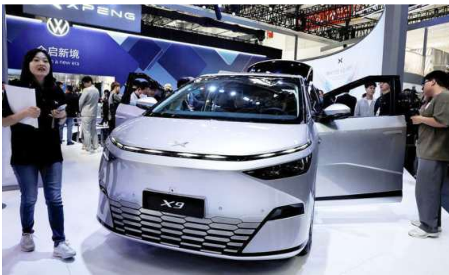
Big fish: Tesla is among the toughest competitors given its ability to collect data from vehicles.

But Tesla faces potent rivals including BYD, China's largest EV maker, and Huawei, a smartphone maker emerging as a national tech champion, that have rolled out systems de-