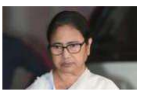
Amit Shah has claimed at a meeting that we have not sent utilisation certificates ₹2.2 crore spending by our govt. I challenge him to prove it MAMATA BANERJEE West Bengal Chief Minister

Repolling concluded in six booths of the Outer Manipur constituency on Tuesday, completing voting for the Lok Sabha poll in the State. Repoll was ordered for 17 polling stations. Chief Electoral Officer told The Hindu that repolling was peaceful with a turnout of 81.16%.