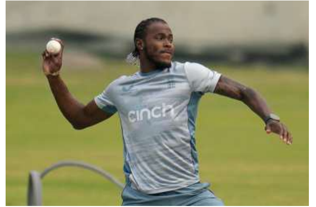
Ready to fire: Archer, who has been out of action due to injury, will be keen to do well at the marquee event. FILE PHOTO

Nortje returns for SA Pacer Anrich Nortje will return to international action after a ninth-month injury layoff while the uncapped