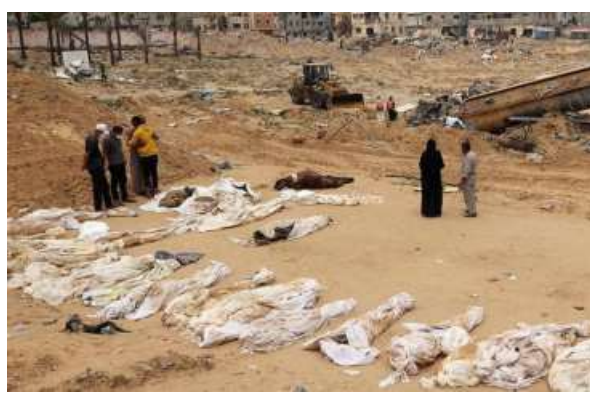
Tragic sight: People gather near bodies unearthed from a mass grave found in the Nasser Medical Complex in southern Gaza.

ICC interview Prosecutors from the International Criminal Court had earlier interviewed