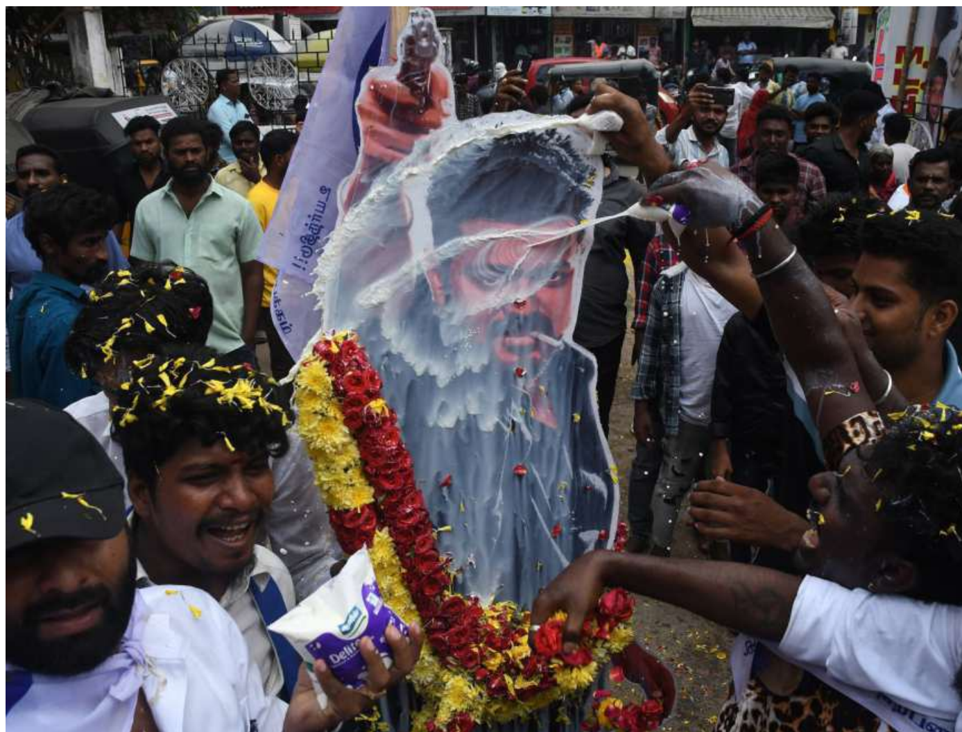
Potent group: Fans utilise their devotion to film stars and cinematic stories to participate in and influence politics, showcasing a distinctive fusion of cultural loyalty and political activism.

Fan accounts were mapped using actor hashtags that they frequently interacted with. These fan accounts were then studied for their interactions with