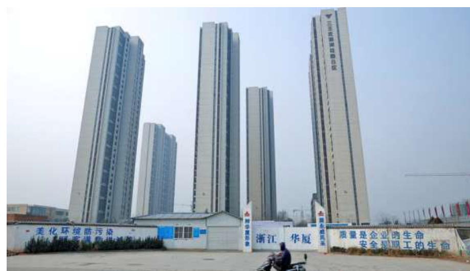
Drying revenue: Real estate downturn affects the ability of cities to lease land to developers.

This meant some local governments were unable to raise funds to pay the promised subsidies, frustrating buyers and casting doubts over future support measures. All of that could