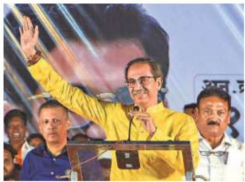
First pick: Shiv Sena (UBT) chief Uddhav Thackeray addressing a public meeting for the Lok Sabha election, in Solapur on Monday.