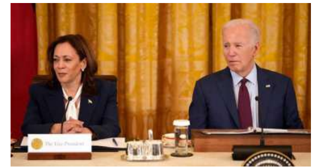
South Asian social and political priorities were aligned with those of the Biden-Harris platform, a speaker at the event says.

South Asians for Biden had reached out to a few hundred thousand South Asian and AAPI voters di-