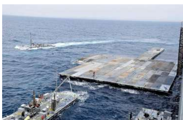
Buoyant effort: An undated image released by the U.S. on Tuesday shows a floating pier under construction off the Gaza Strip.

Under the plan by the U.S. military, aid will be