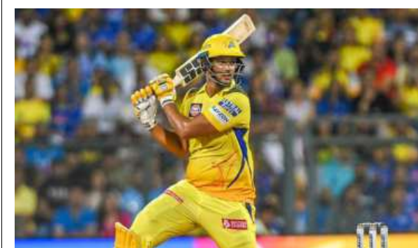
Multi-dimensional: Dube has shown that there's a lot more to him than just smashing the spinners out of sight. EMMANUEL YOGINI