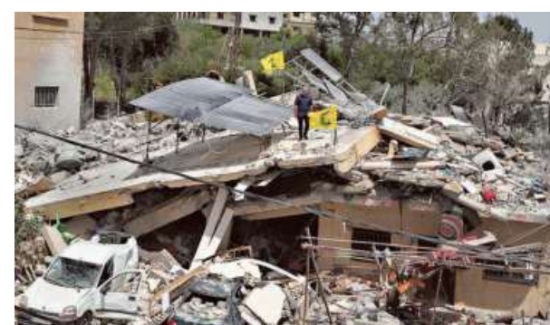
A house destroyed by an Israeli strike in Lebanon as exchange of fire continues between Israeli forces and Hezbollah militants.

"We call for an immediate ceasefire and the protection of children and civilians," he said.