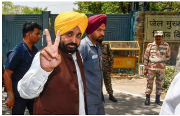
In solidarity: Punjab Chief Minister Bhagwant Mann leaves after meeting Delhi CM Arvind Kejriwal in Tihar Jail on Tuesday.

arguments on May 3. Justice Khanna said the Central agency has to address the court "on the timing of his [Mr. Kejriwal's] arrest before the elections". The court's insistence that the agency should address the issue was significant as the Delhi Chief Minister has based his petition on the argument that his arrest was timed to crush the Opposition ahead of the general election. Mr. Kejriwal and the Aam Aadmi Party (AAP) he heads have portrayed the ED as a "tool" for the ruling BJP. "What was so imminent about my arrest? Was I a hardened criminal or a terrorist who would run away... So, did you leave a guilty Chief Minister to roam free all these years?" senior advocate A.M. Singhvi, appearing for the