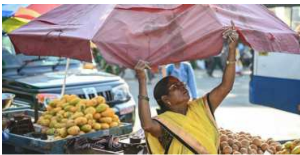
Mercury surging: A fruit vendor sets up an umbrella to protect her as Bengaluru experienced a surge in temperature.

"In 1983, we did not record any rain in April. Since then, we have had rain/light rainfall in April. After 1983, this is the first year when we have not had any rainfall, making this