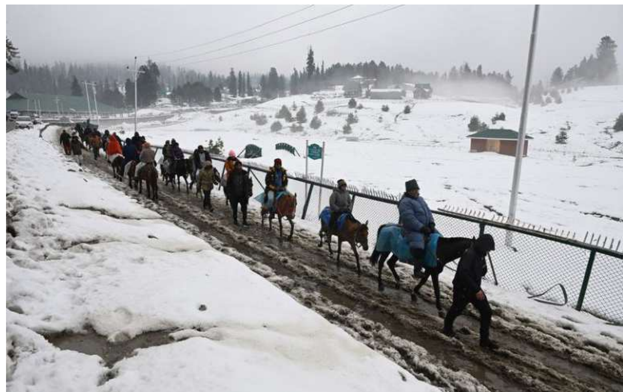
Steady trot: Tourists enjoy pony rides in fresh snowfall at Gulmarg in north Kashmir on Tuesday.