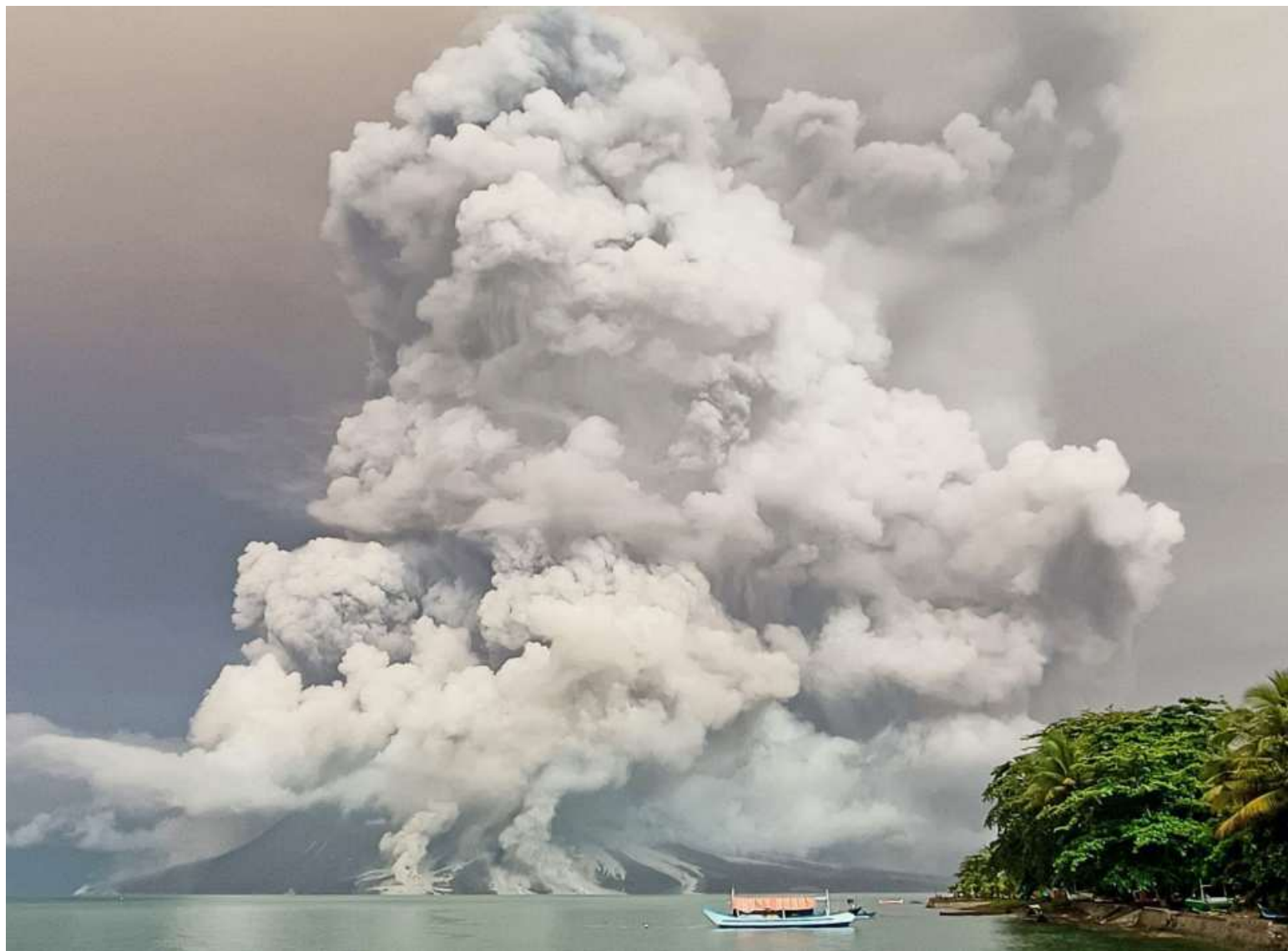
Mount Ruang seen erupting from Tagulandang island in Sitaro, North Sulawesi, on Tuesday. Ruang's eruption prompted authorities to order an evacuation and forced a nearby airport to close. The remote Indonesian volcano sent a tower of ash spewing into the sky on April 19.