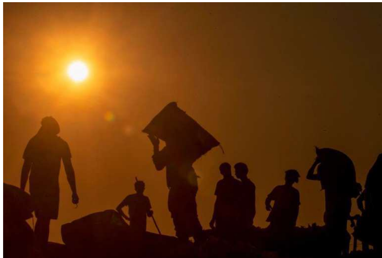
Despite scorching heat, workers load salt bags from the fields along the shore in Kothapatnam village of Andhra Pradesh. KOMMURI SRINIVAS