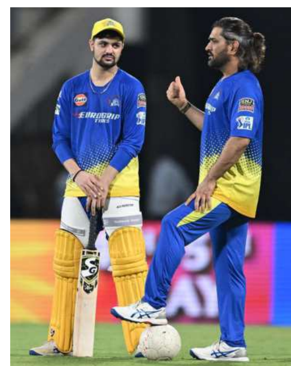
Waiting for another chance: It remains to be seen whether CSK will give Rizvi one more opportunity.

Meanwhile, the Kings arrived in the city in a buoyant mood after their sensational record-chase of 262 against Kolkata Knight Riders. The win was set up by openers Prabhsimran Singh and Jonny Bairstow, both of whom finally came to the fore after an underwhelming start to the season. If the top-order can be more consistent, it eases the burden on Shashank