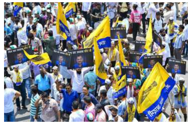
AAP supporters hold placards of jailed Chief Minister Arvind Kejriwal during an INDIA bloc rally in Mumbai.

A senior Delhi Congress leader said both parties had agreed to finalise a joint poll road map over the next two days. The leaders also agreed to meet regularly to take stock of the ground situation and "fully activate ground-level workers to defeat the BJP in all seven Lok Sabha seats of Delhi and 10 seats