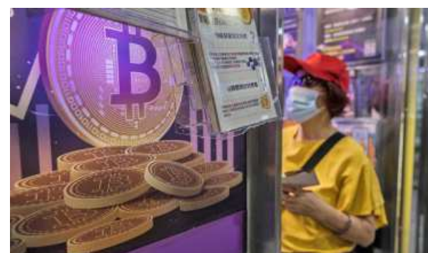
Following suit: The debut comes three months after the U.S. gave the green light to ETFs pegged to bitcoin's spot price.

Hong Kong's pioneering crypto ETFs on the city's bourse include six funds issued by three managers — Boseru Funds, China Asset Management (Hong Kong) Limited and Harvest Glo-