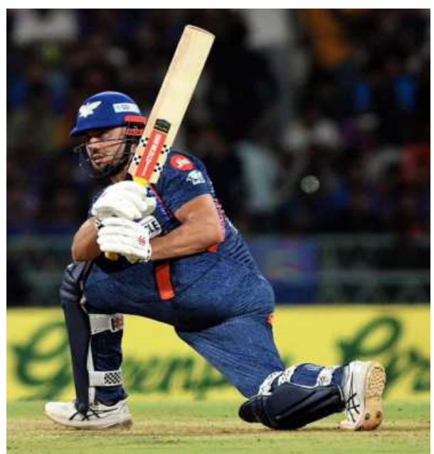
Pulling his weight: Stoinis complemented his effective bowling with some resourceful batting.

Ishan Kishan's match-saving 53-run alliance with Nehal Wadhara (46, 41b, 4x4, 2x6) allowed MI some breathing time before rear-guard muscle from Tim David (35 n.o., 18b, 3x4, 1x6) took it to 144 for seven.