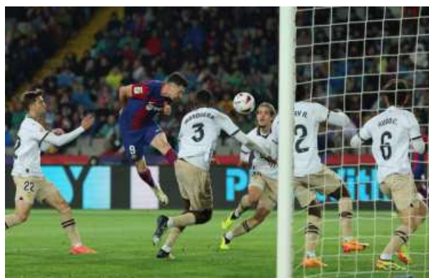
Triple delight: Lewandowski heads in one of his three goals.

Barcelona's win postponed for a couple of weeks Real Madrid's almost inevitable title celebrations as Carlo Ancelotti's side sit atop the standings on 84 points.